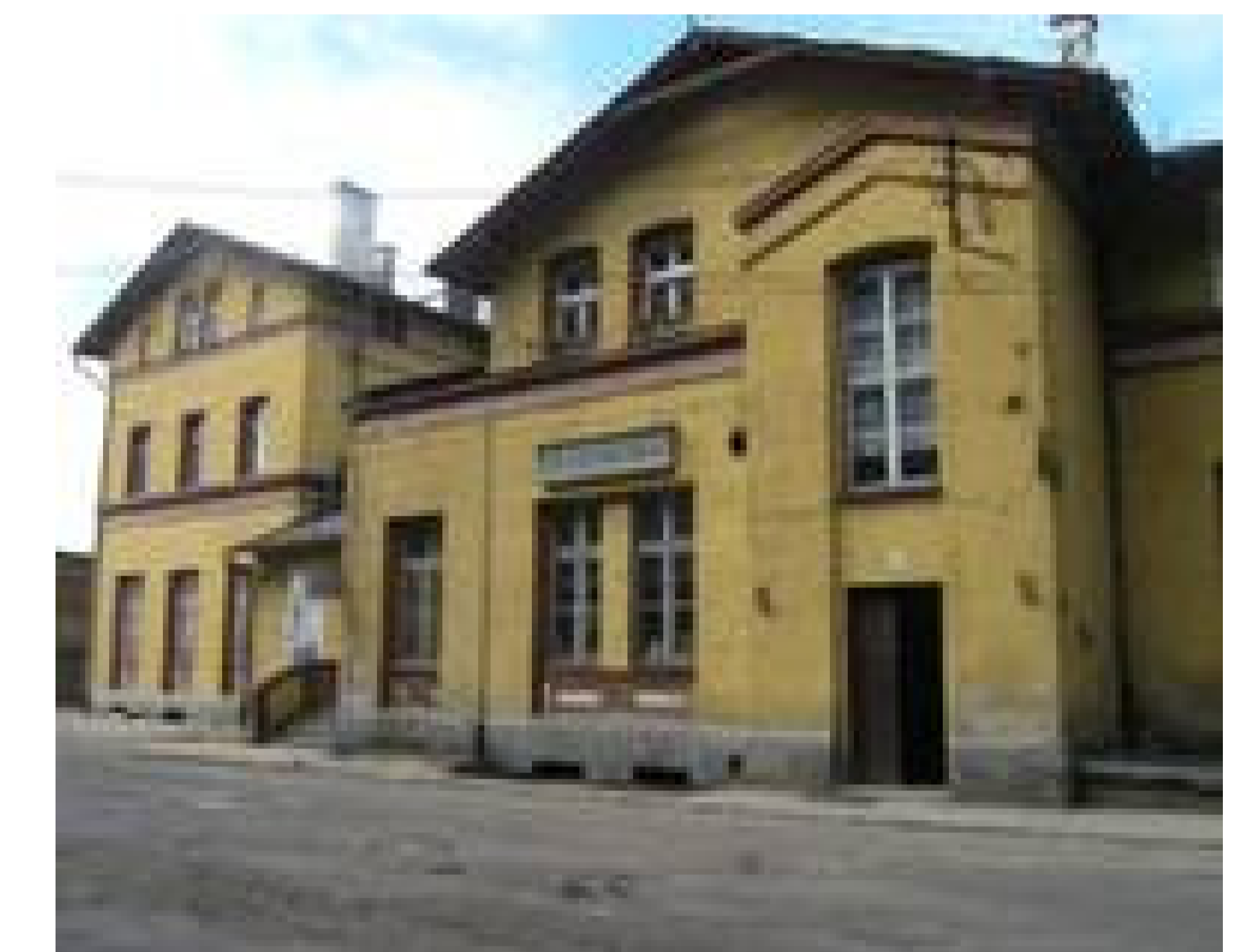
Old train station from 1900