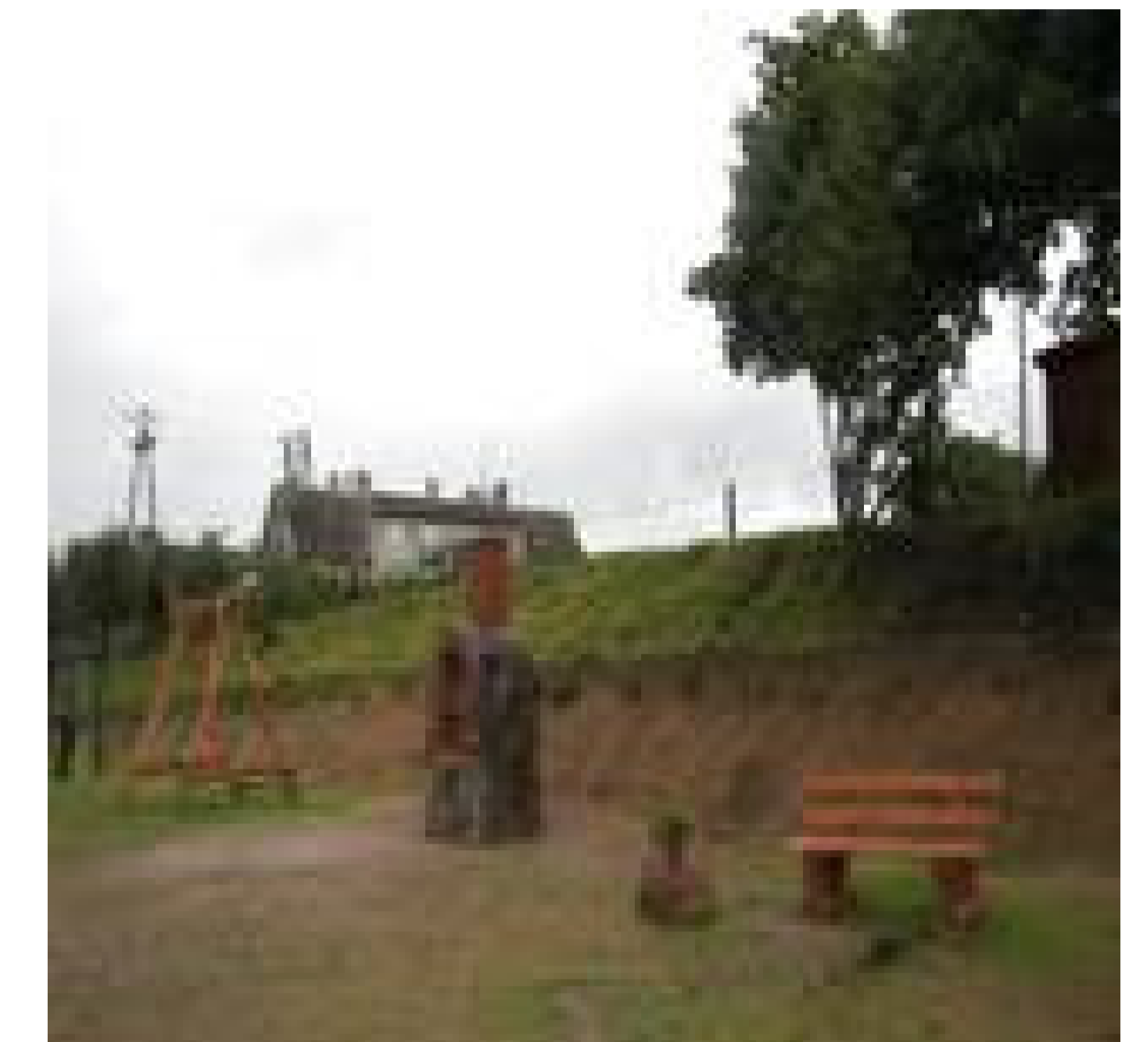
Recreational place and playground for children