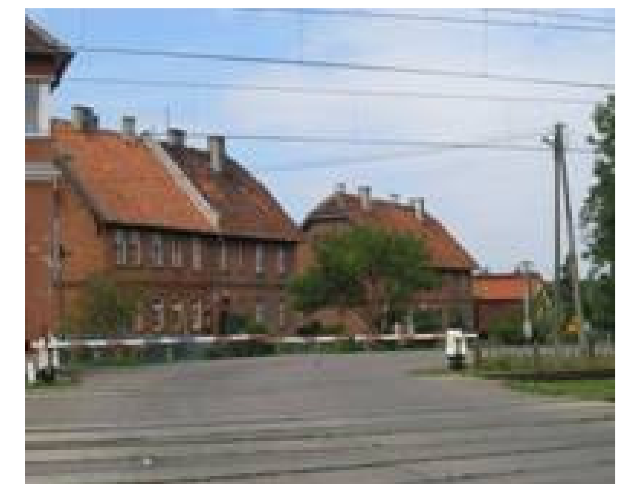
Houses of last workers of rail