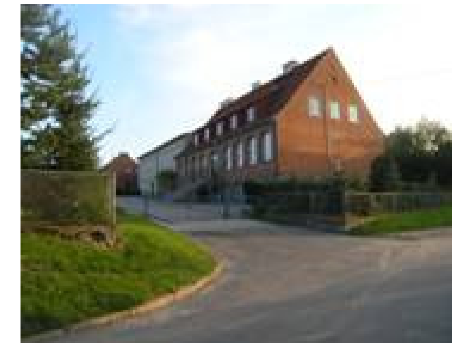
The primary school and the sport place