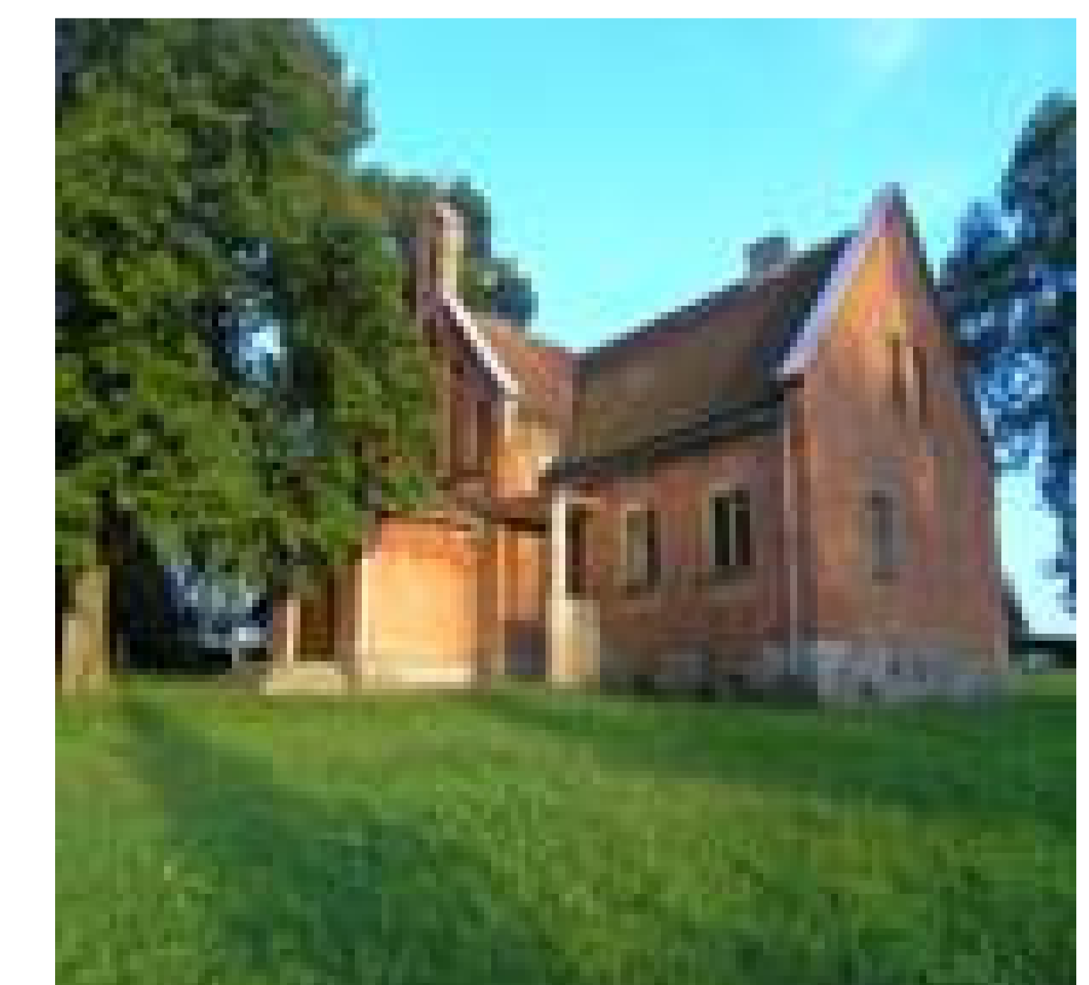
The church with cemetery and parc