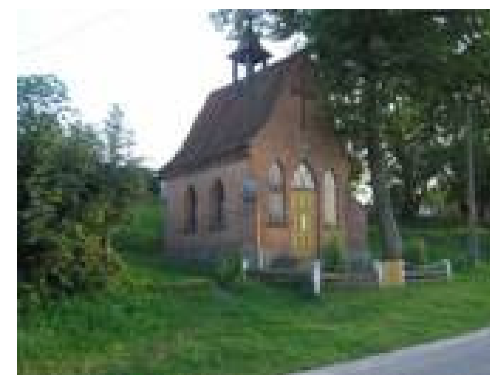
The old chapel