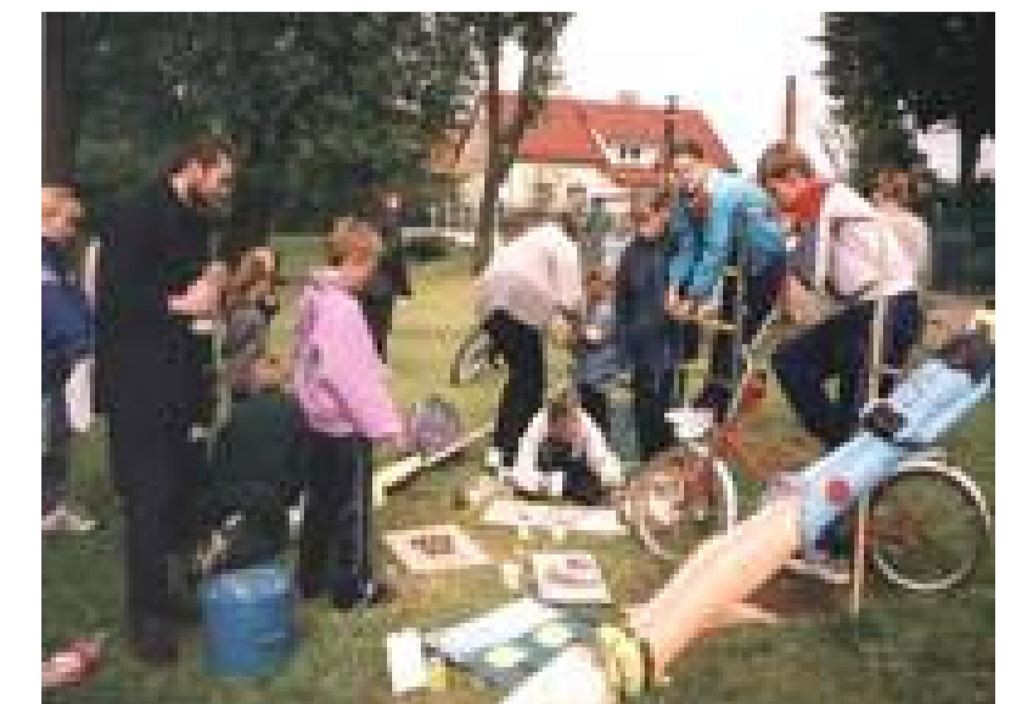
Children from primary school during art competition