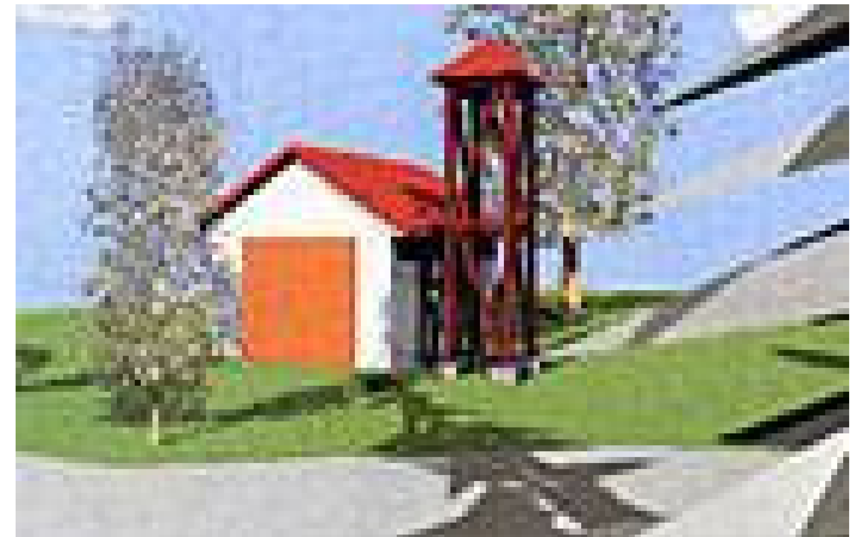
Vision of the bell tower