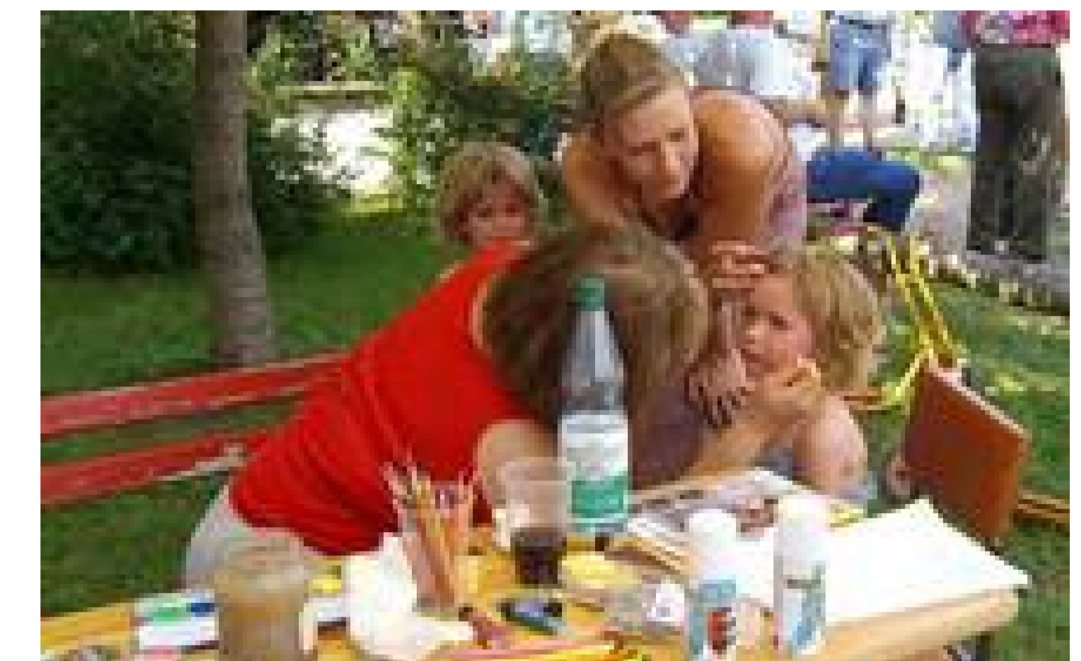
Village festival 2007

Try to incorporate more young people into social activities!