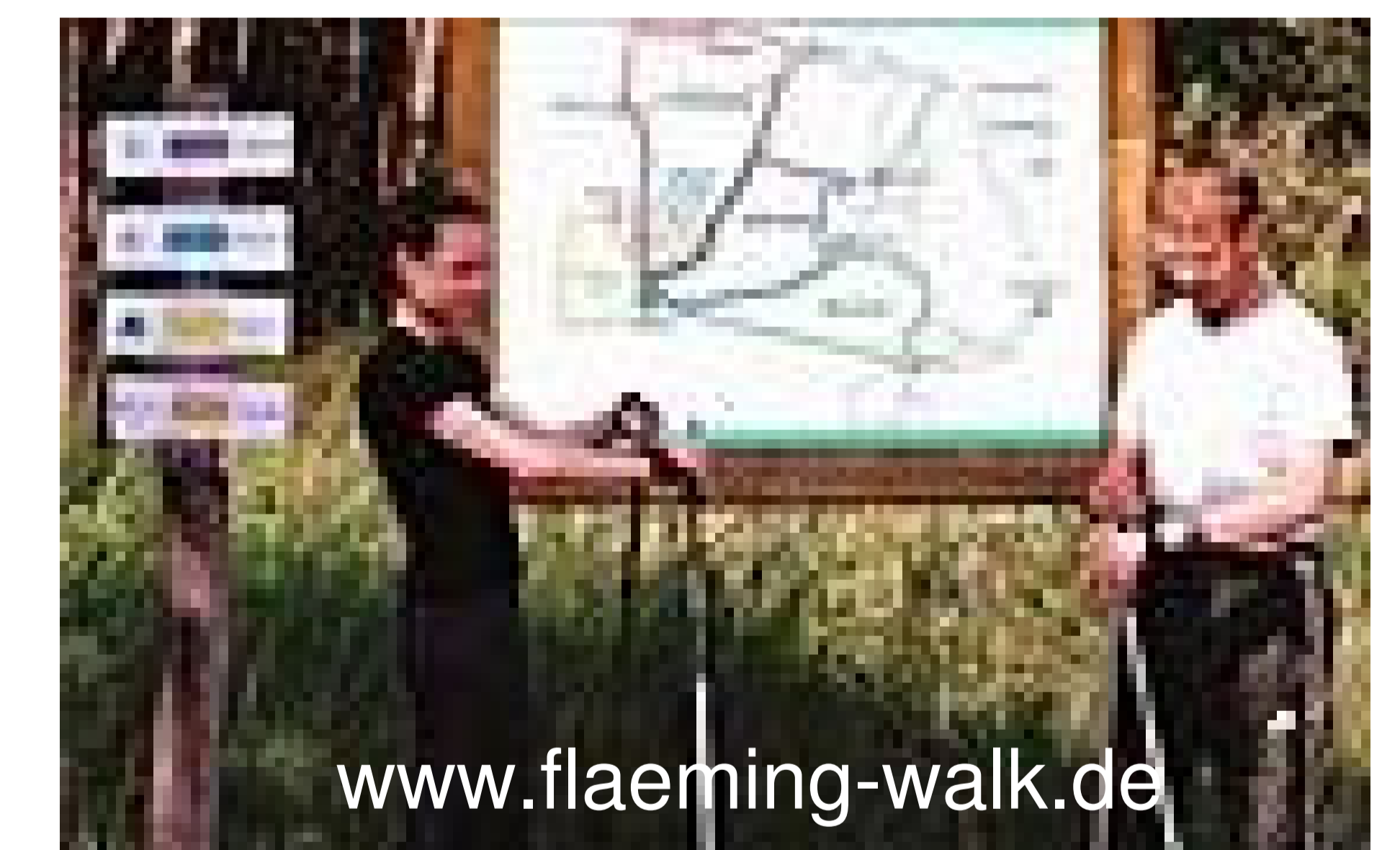
Nordic Walking centre