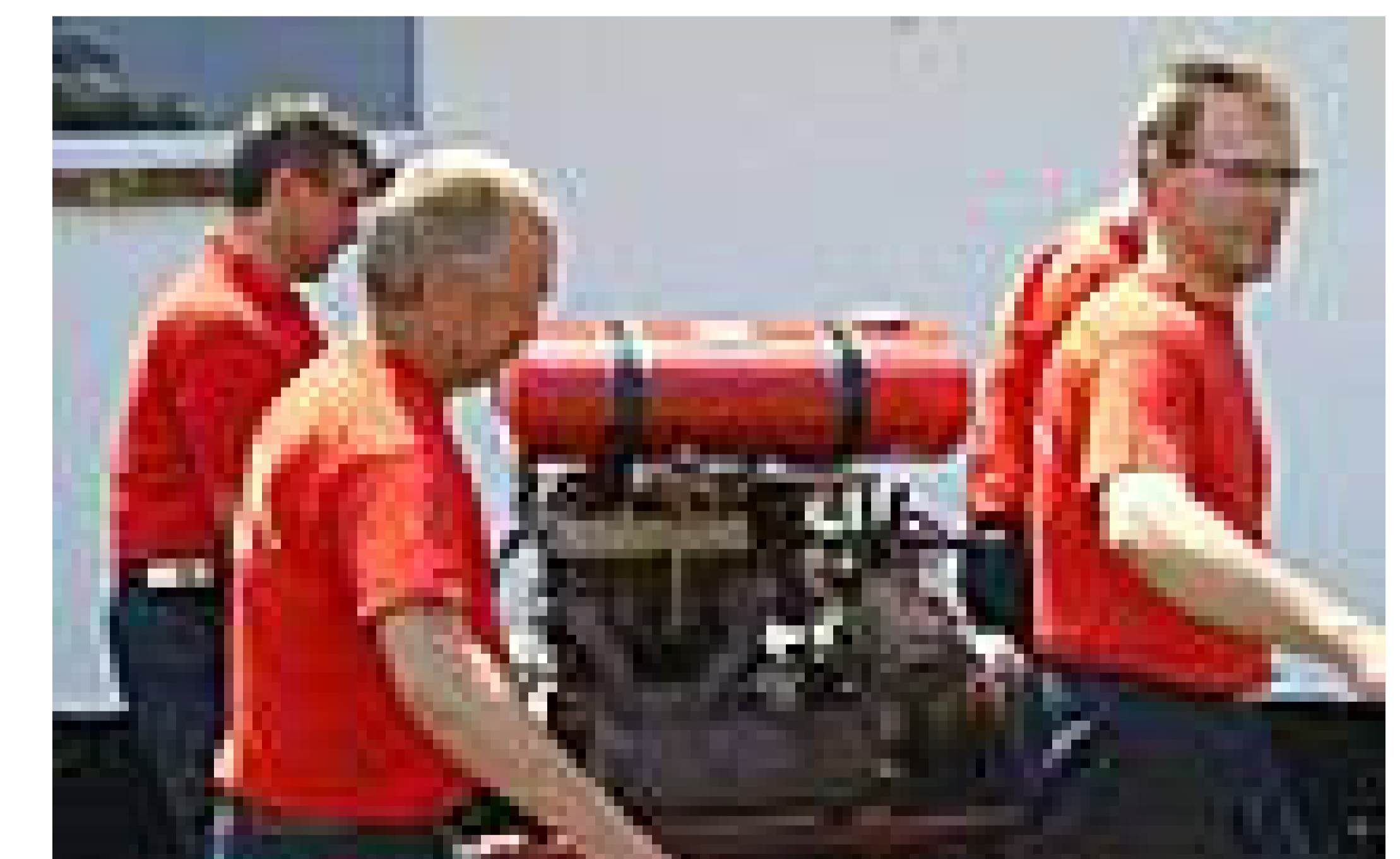
Auxiliary fire brigade