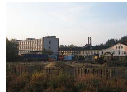
The investment site ready to by used