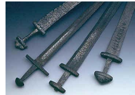
The historical heritage