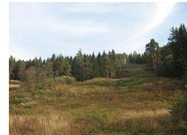
The future ski resort