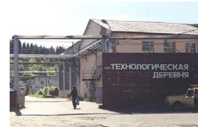
Technological village is a habitation place for businesses