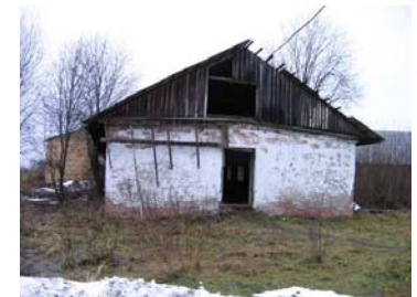
And a hotel there