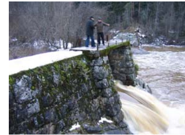
Power station to power the enterprises