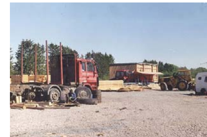
One of them successfully living