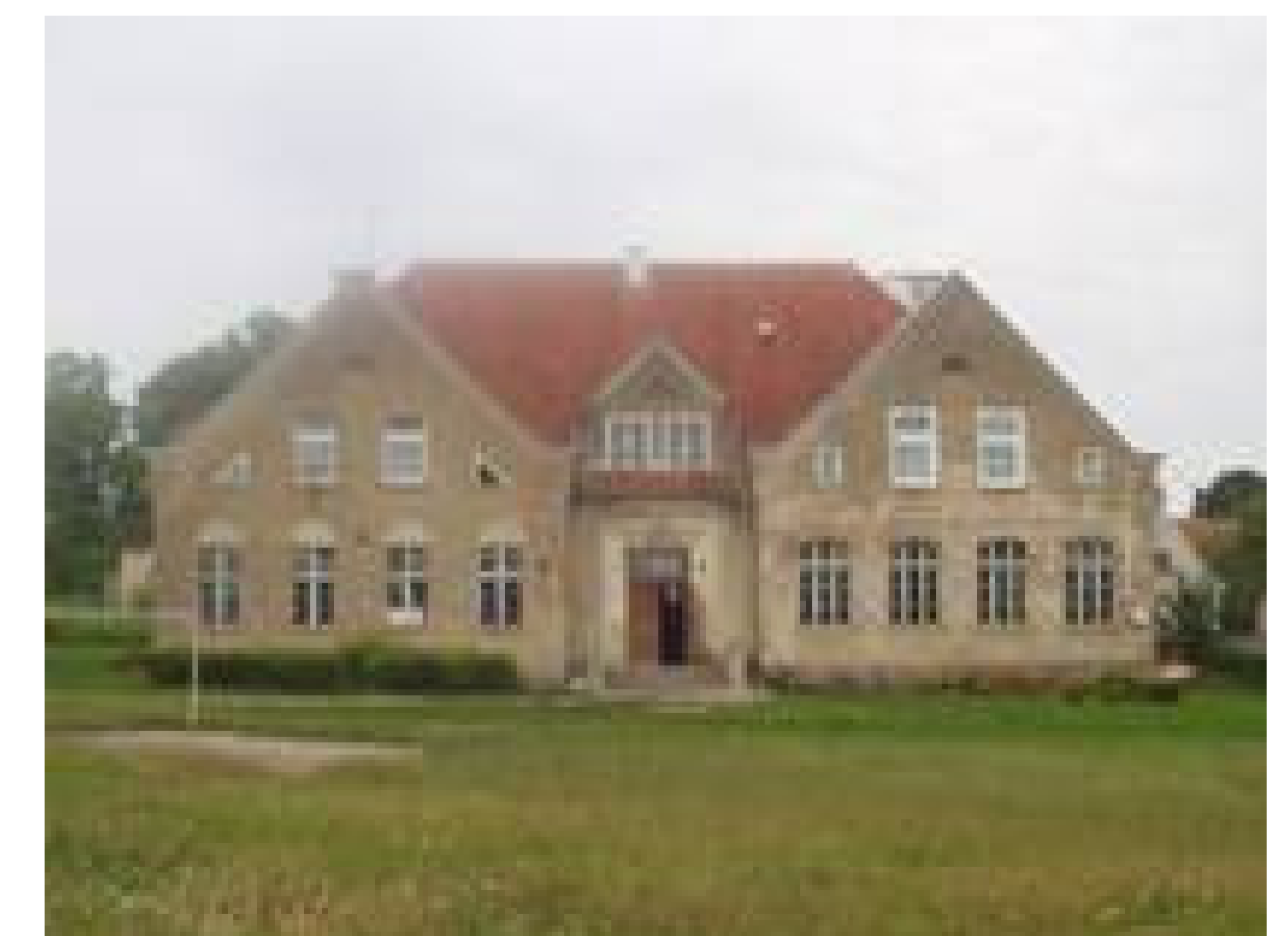
The old palac, now privat flats