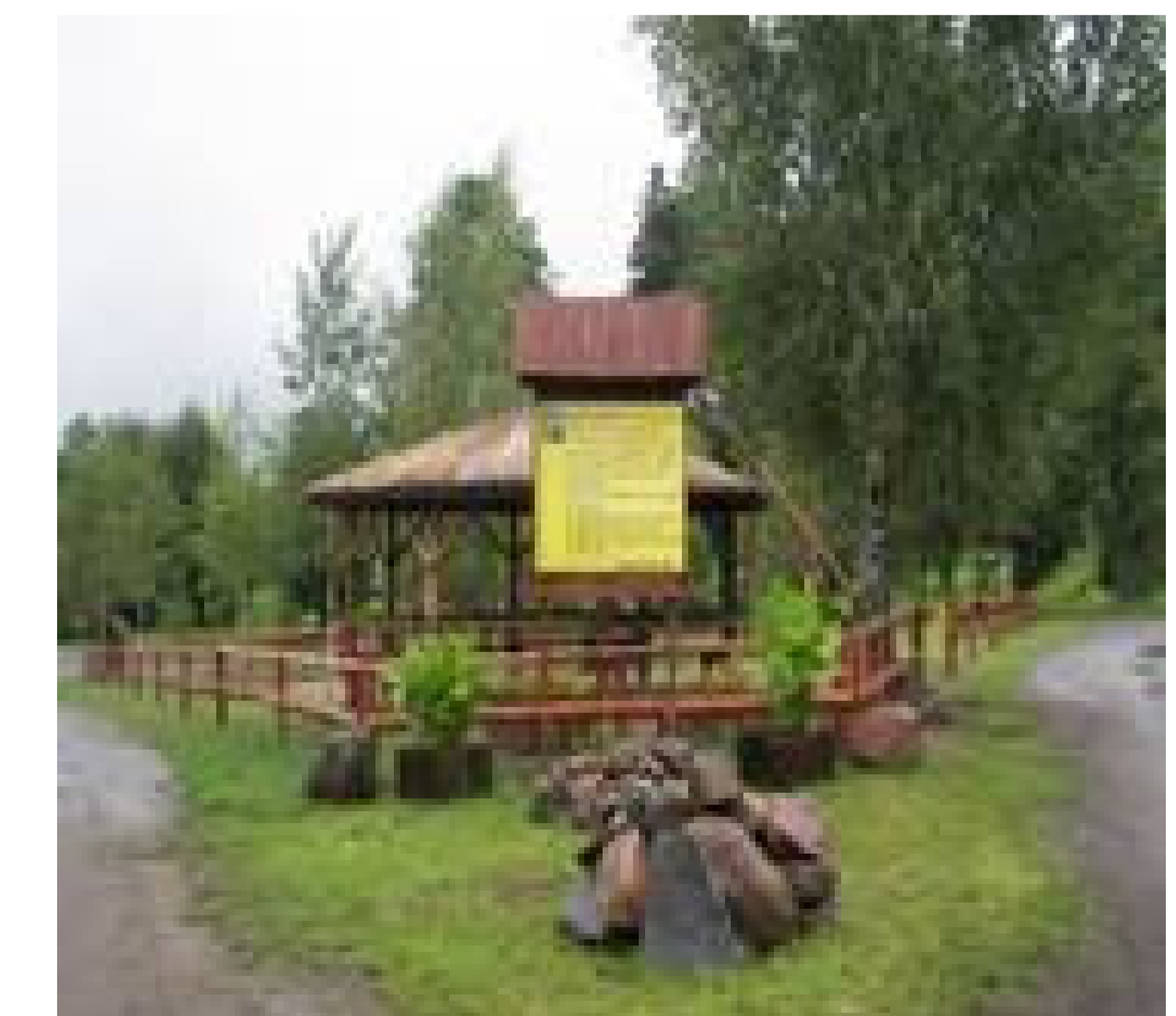
Public spaces in village