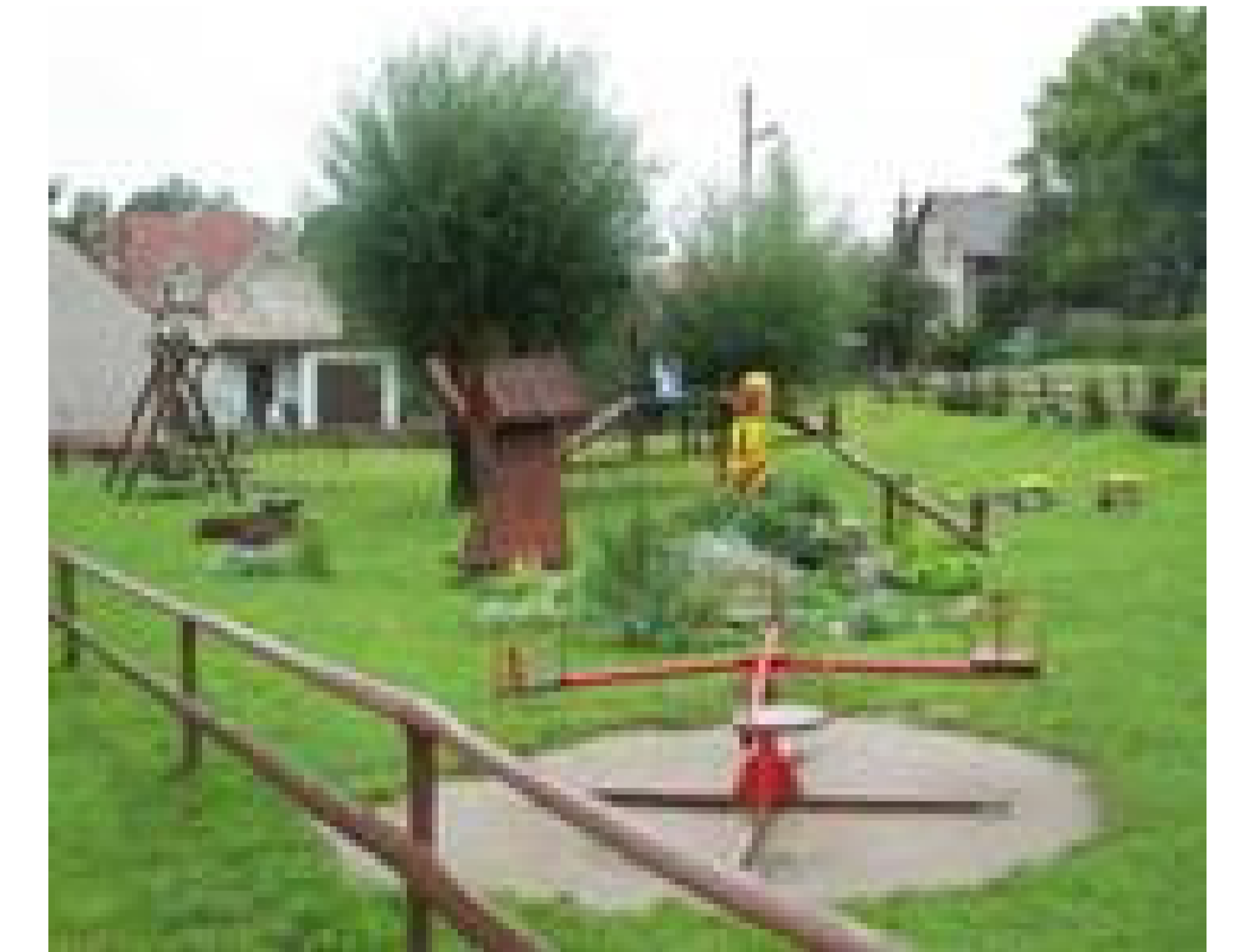
New playground for children