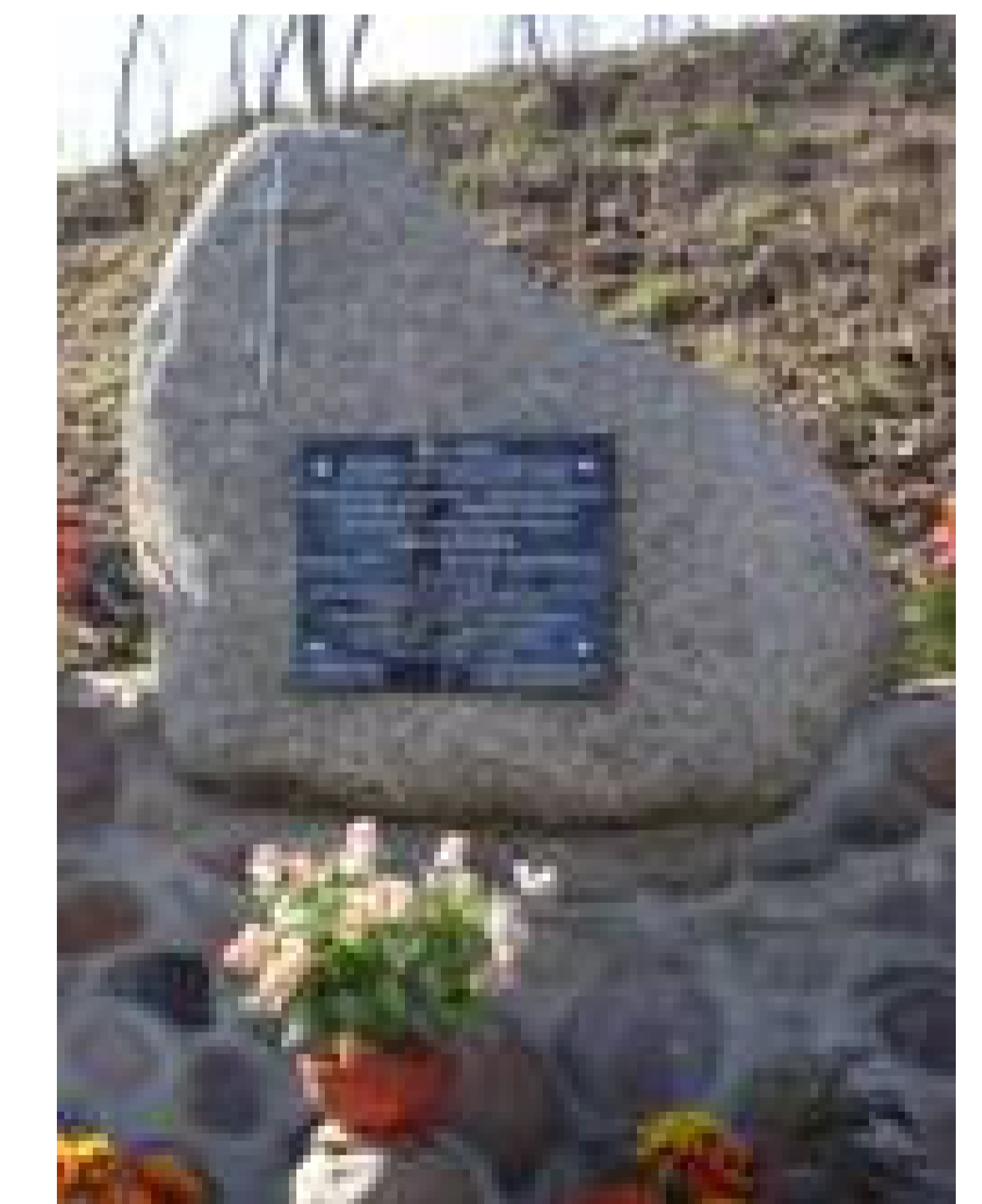
The place of memory of German inhabitants