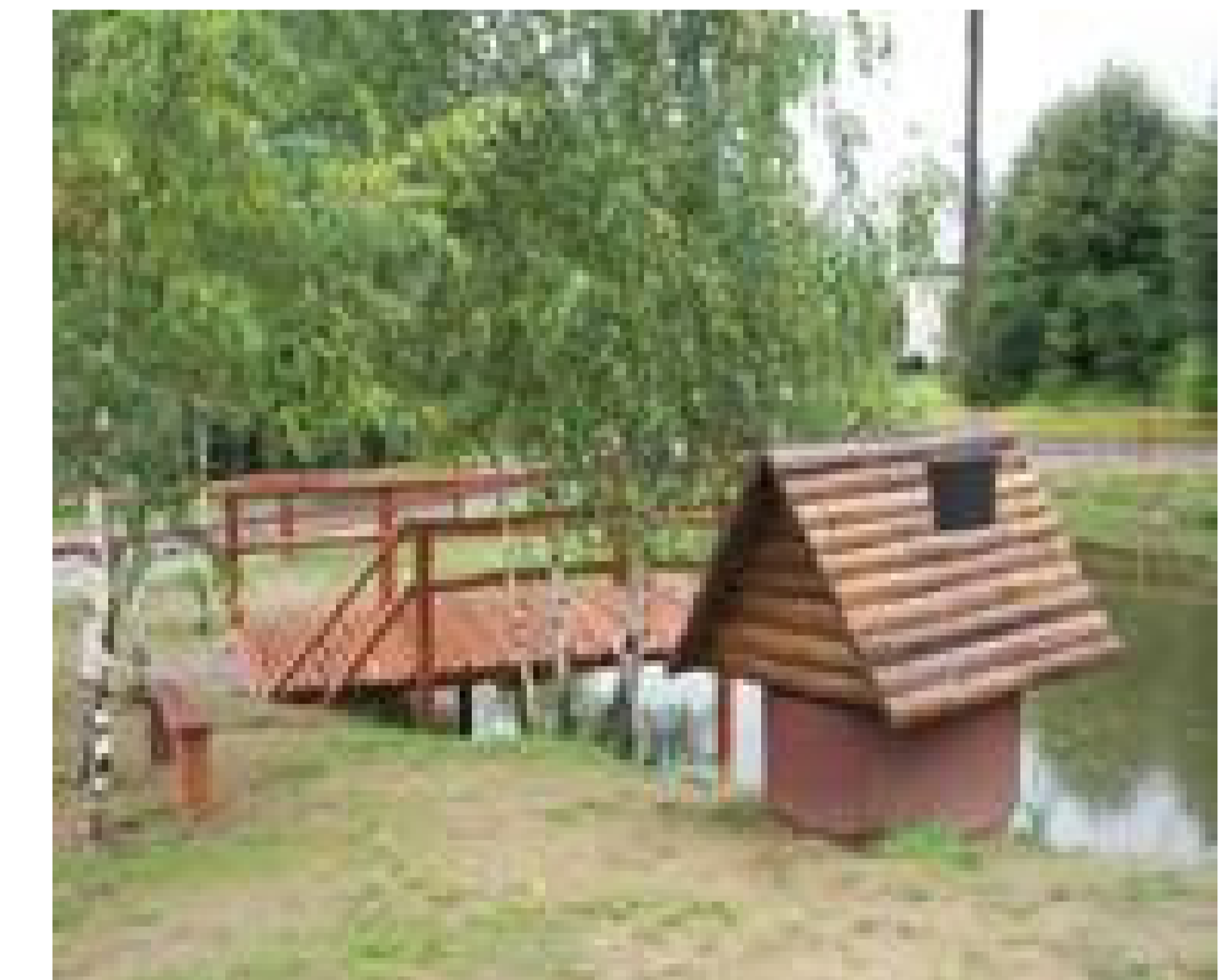
New recreational area fr inhabitants