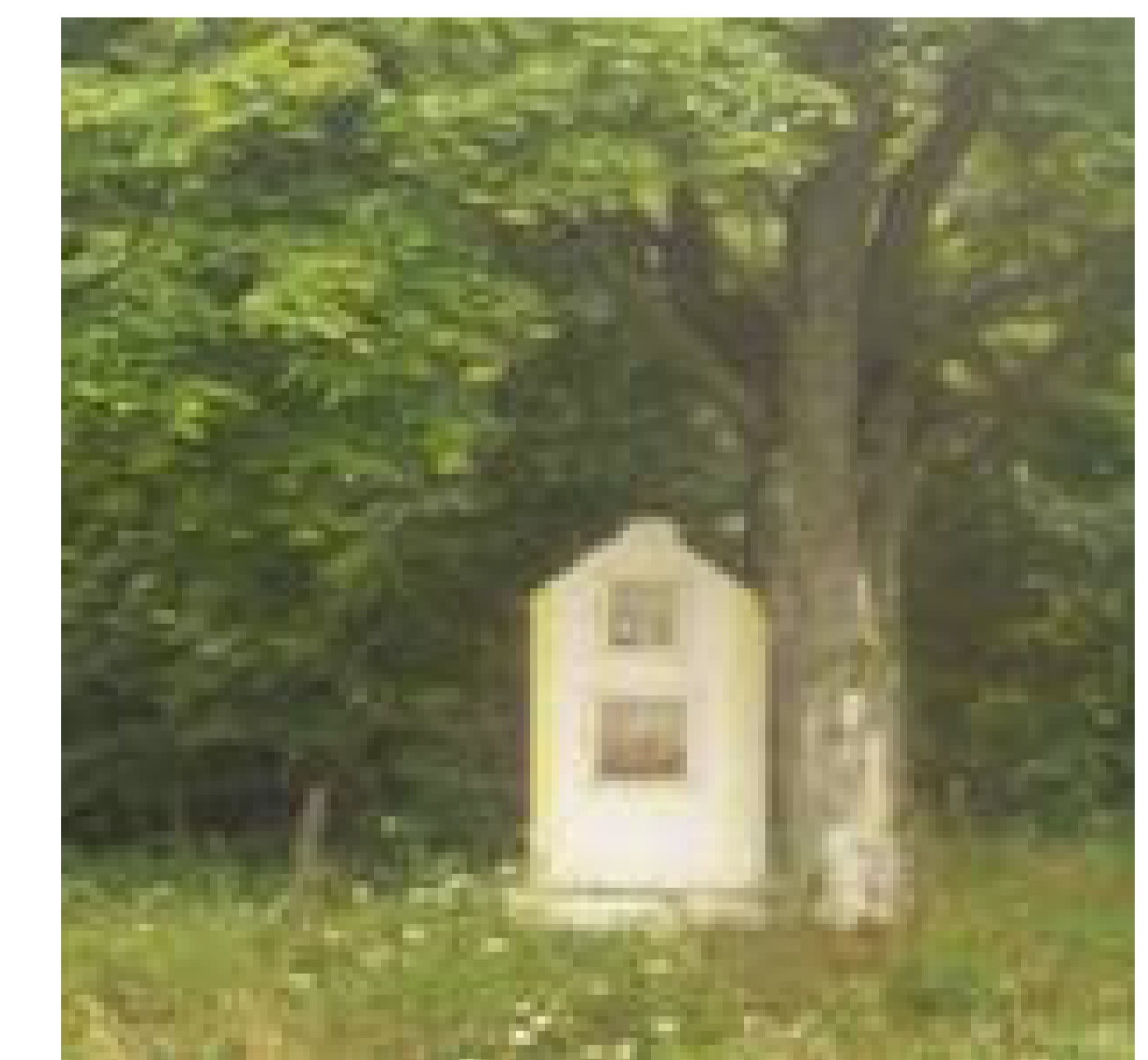
The old chapel