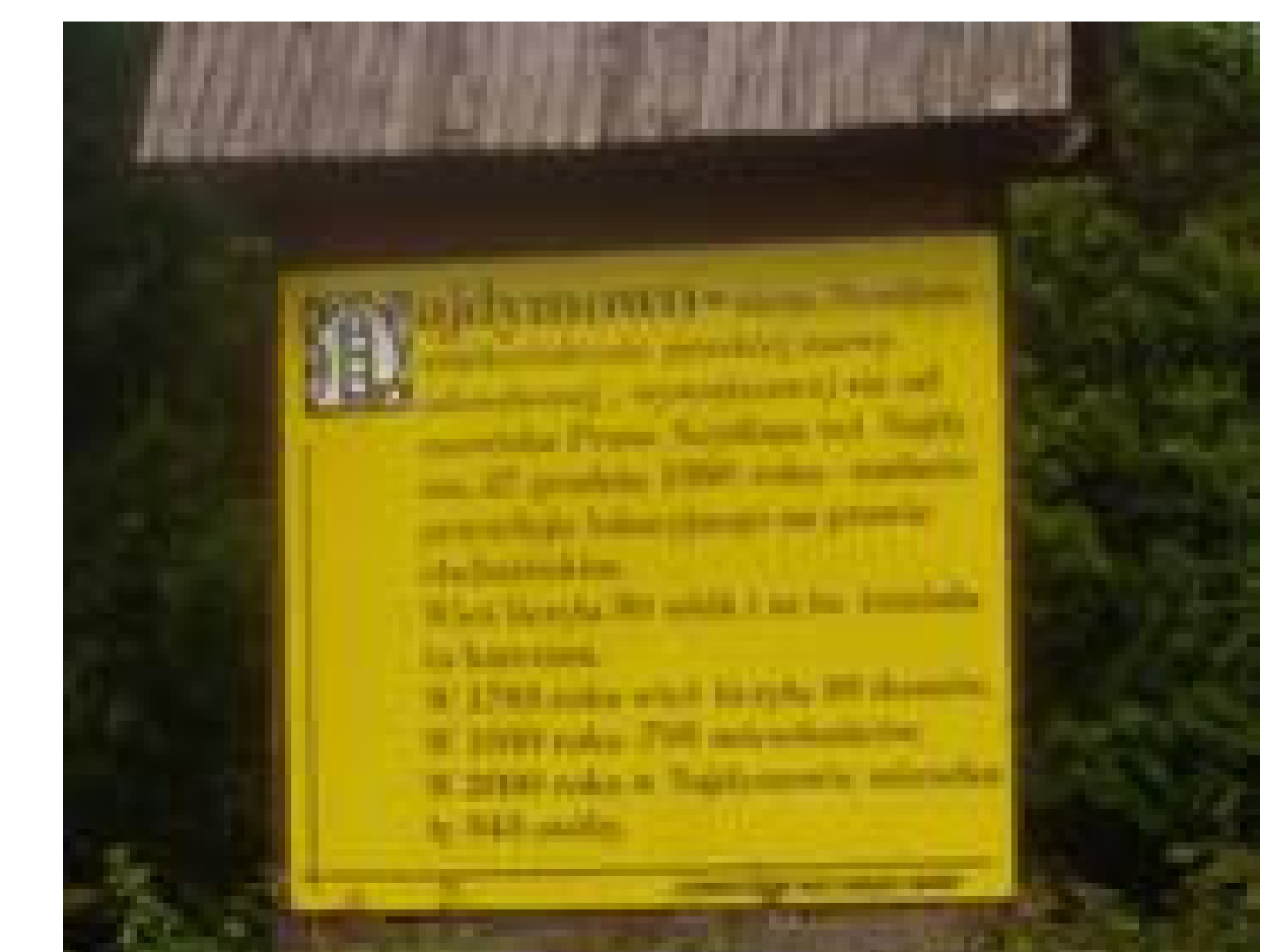
Information about history of Najdymowo