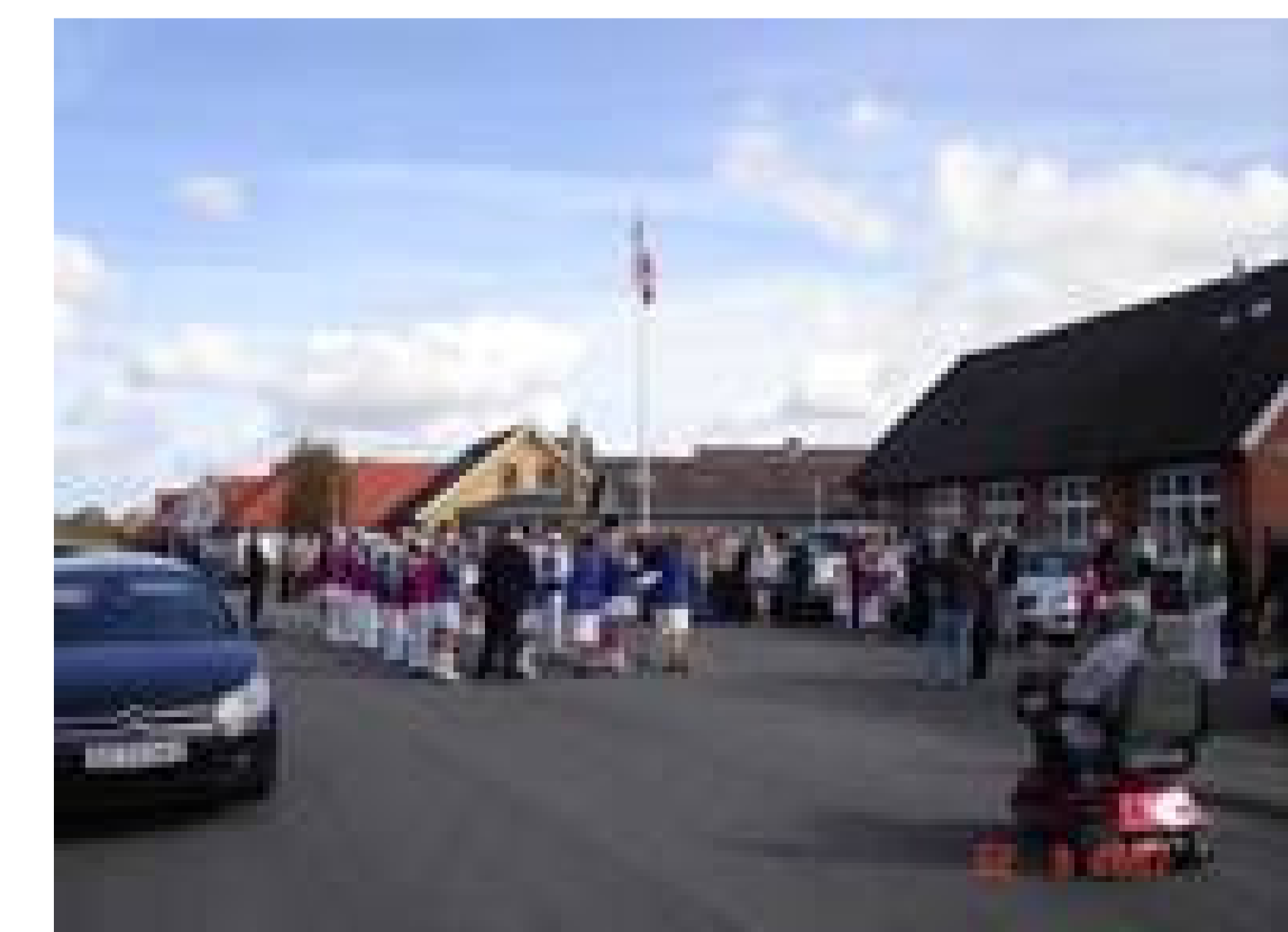
Trade fair in Ramsing Sept. 2007