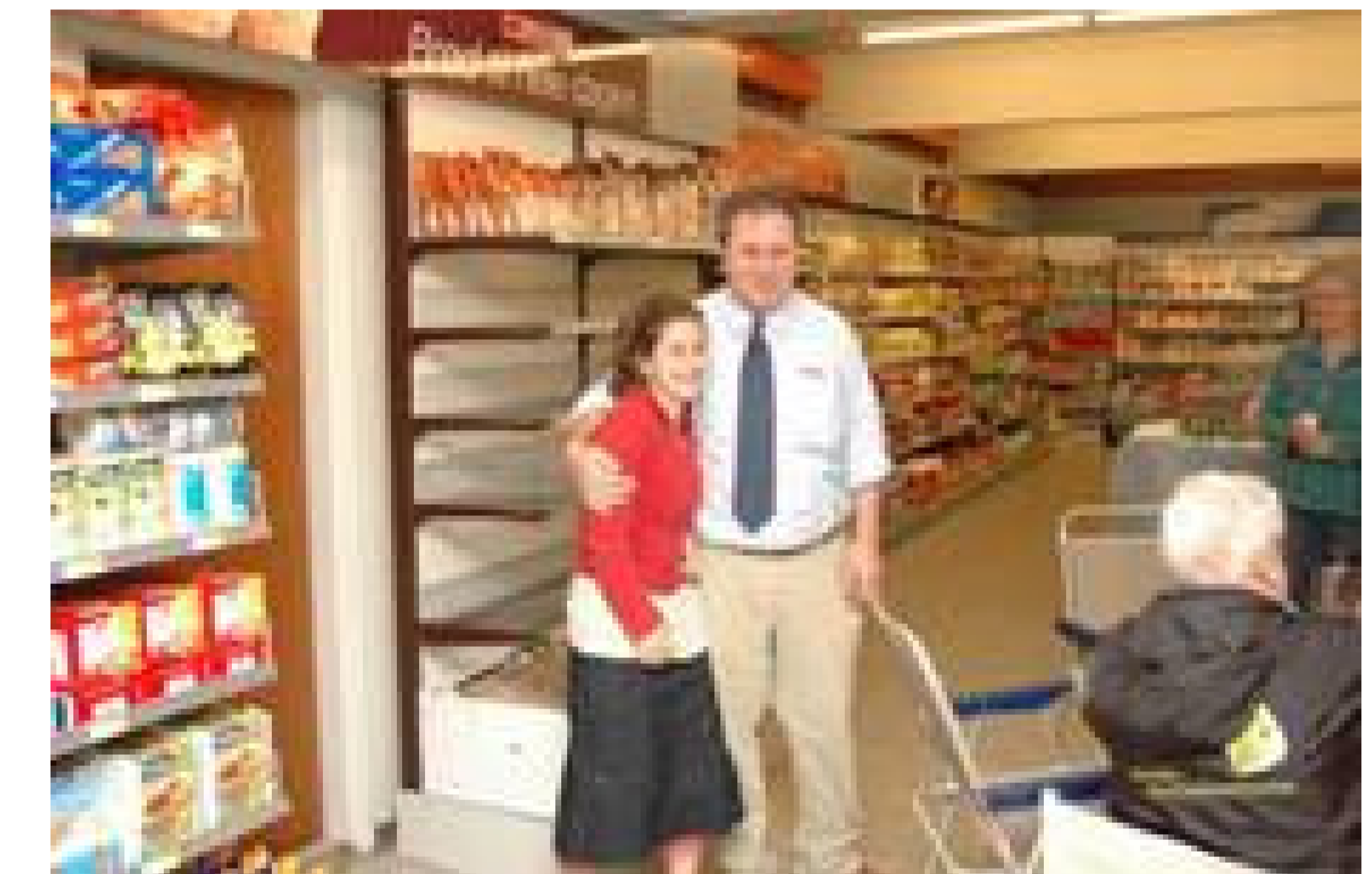
In October 2007 the grocer's shop reopened.