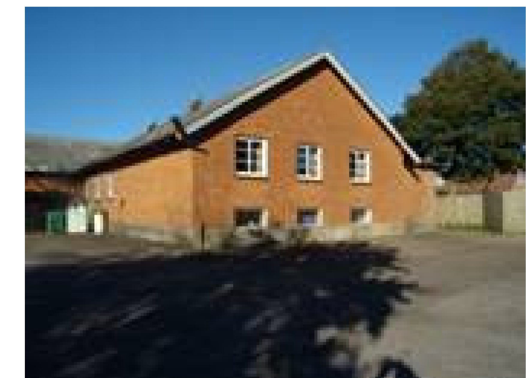
The Village hall