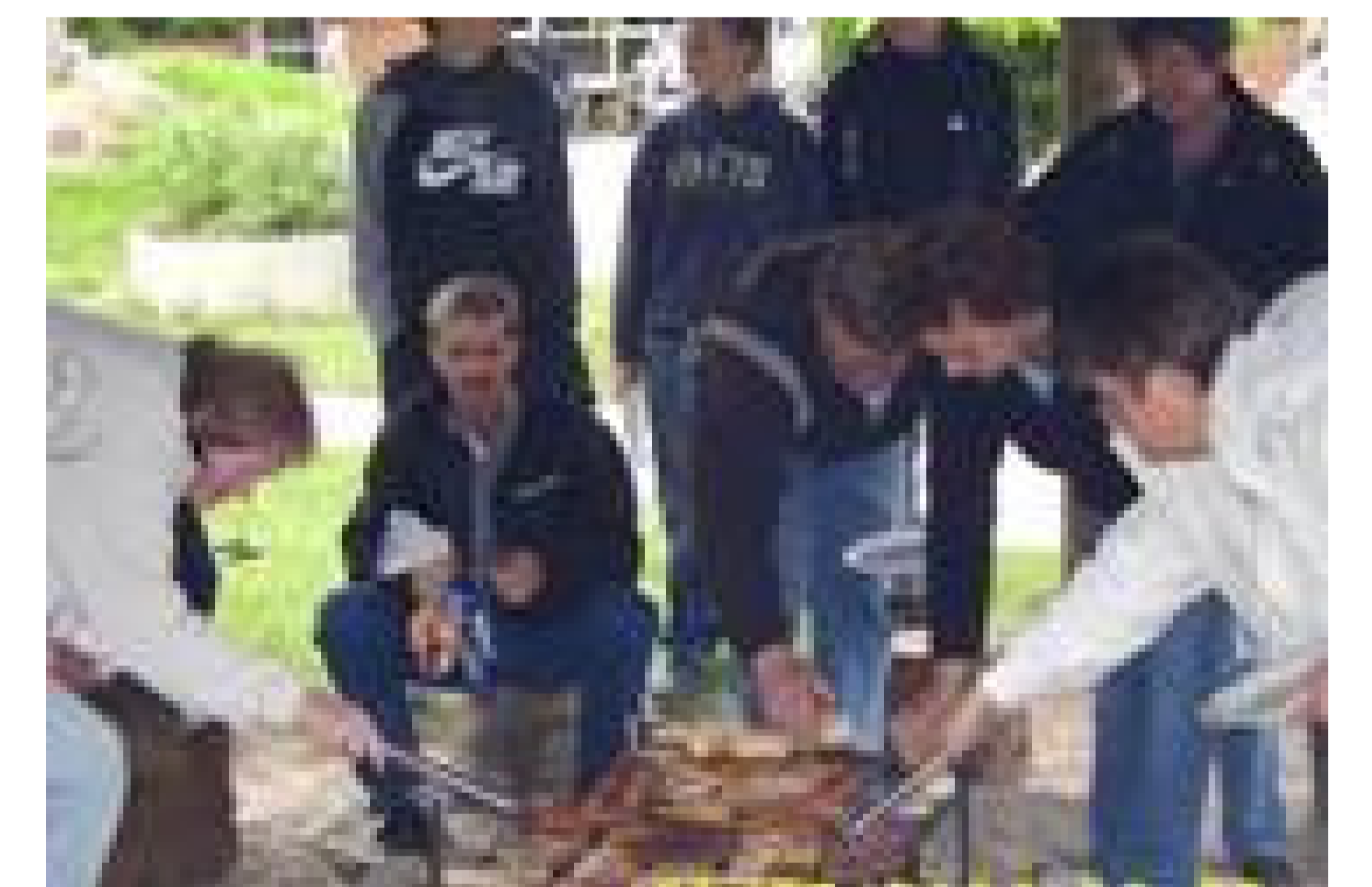
After a hard days work it is good to get together and eat in the park