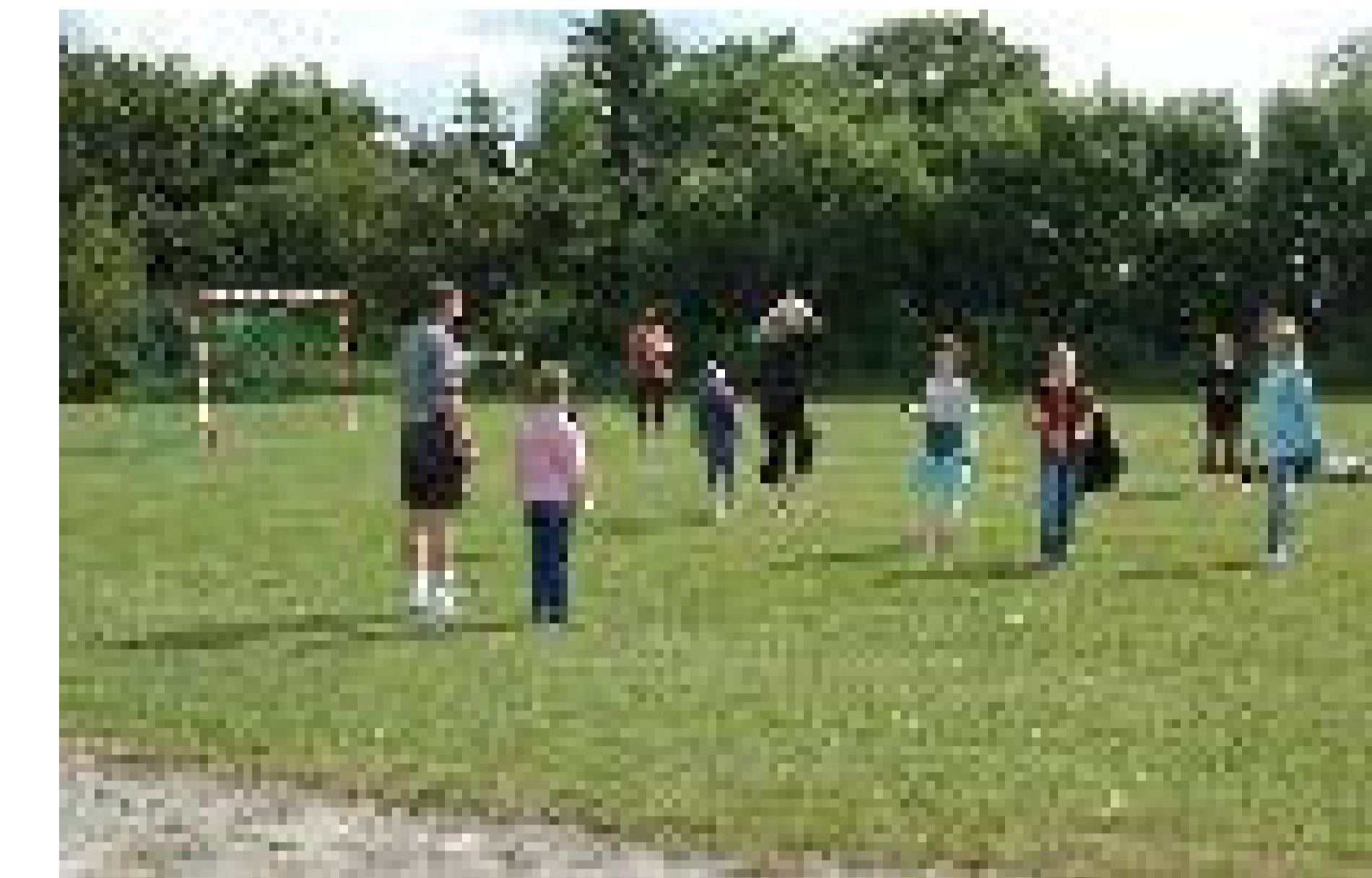
Midsummer celebration in the minipark – soccer game!