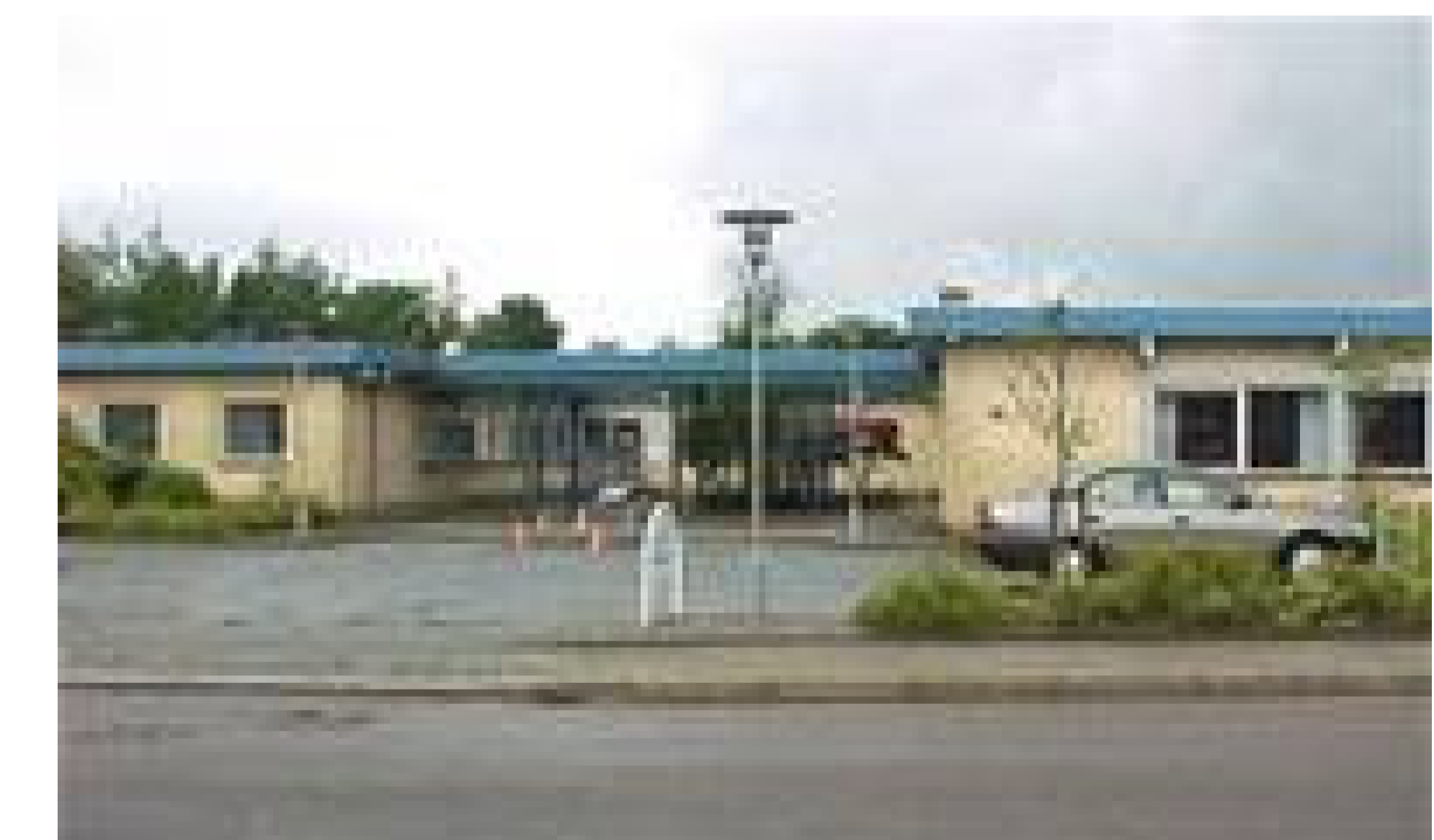
The municipal administration has an office in Ramsing