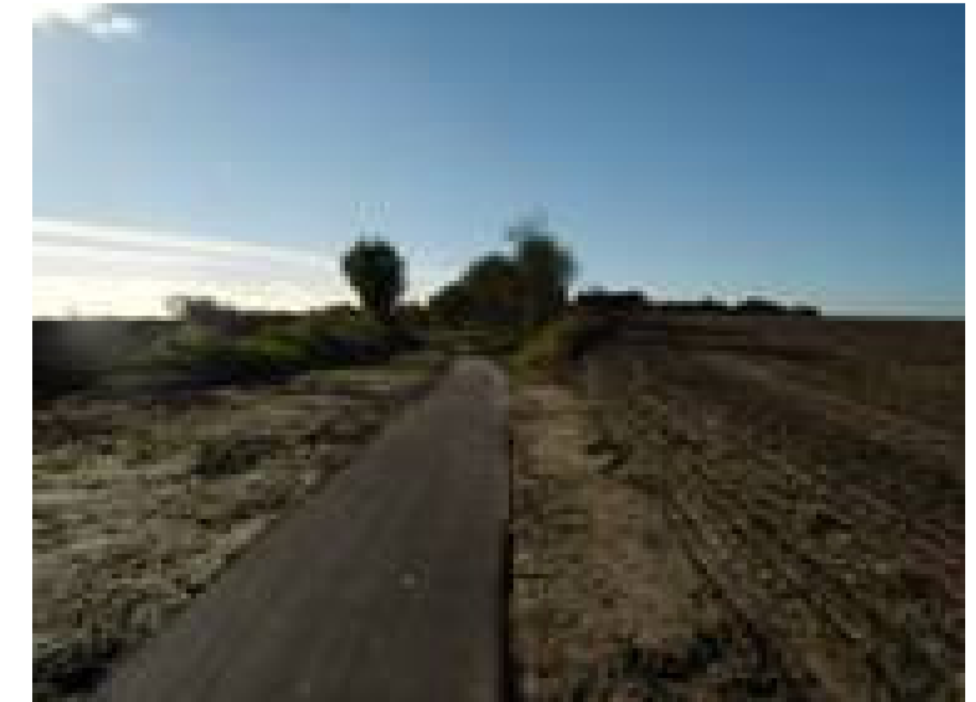
The bike path will run through Ramsing soon