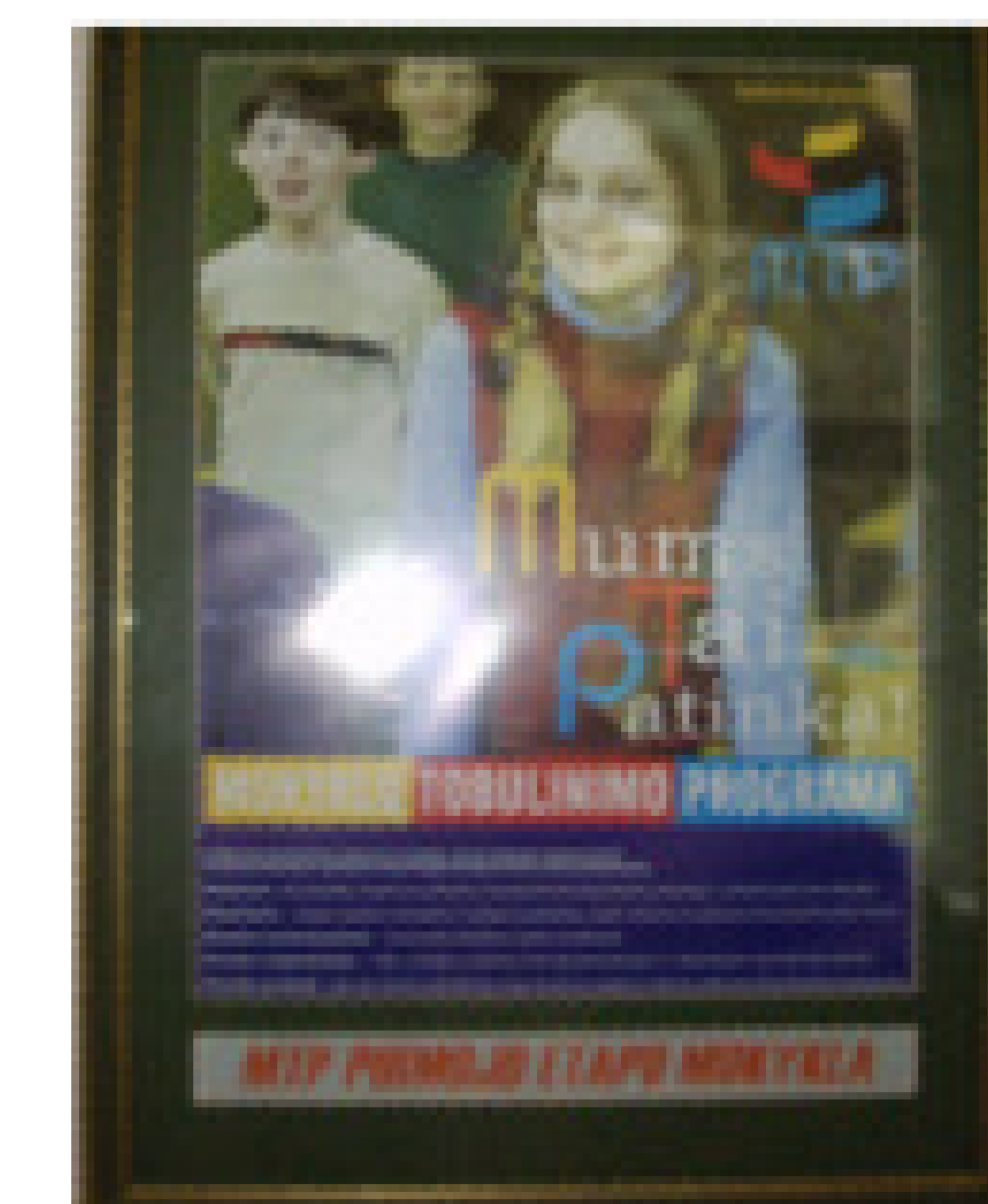
Active pupils search