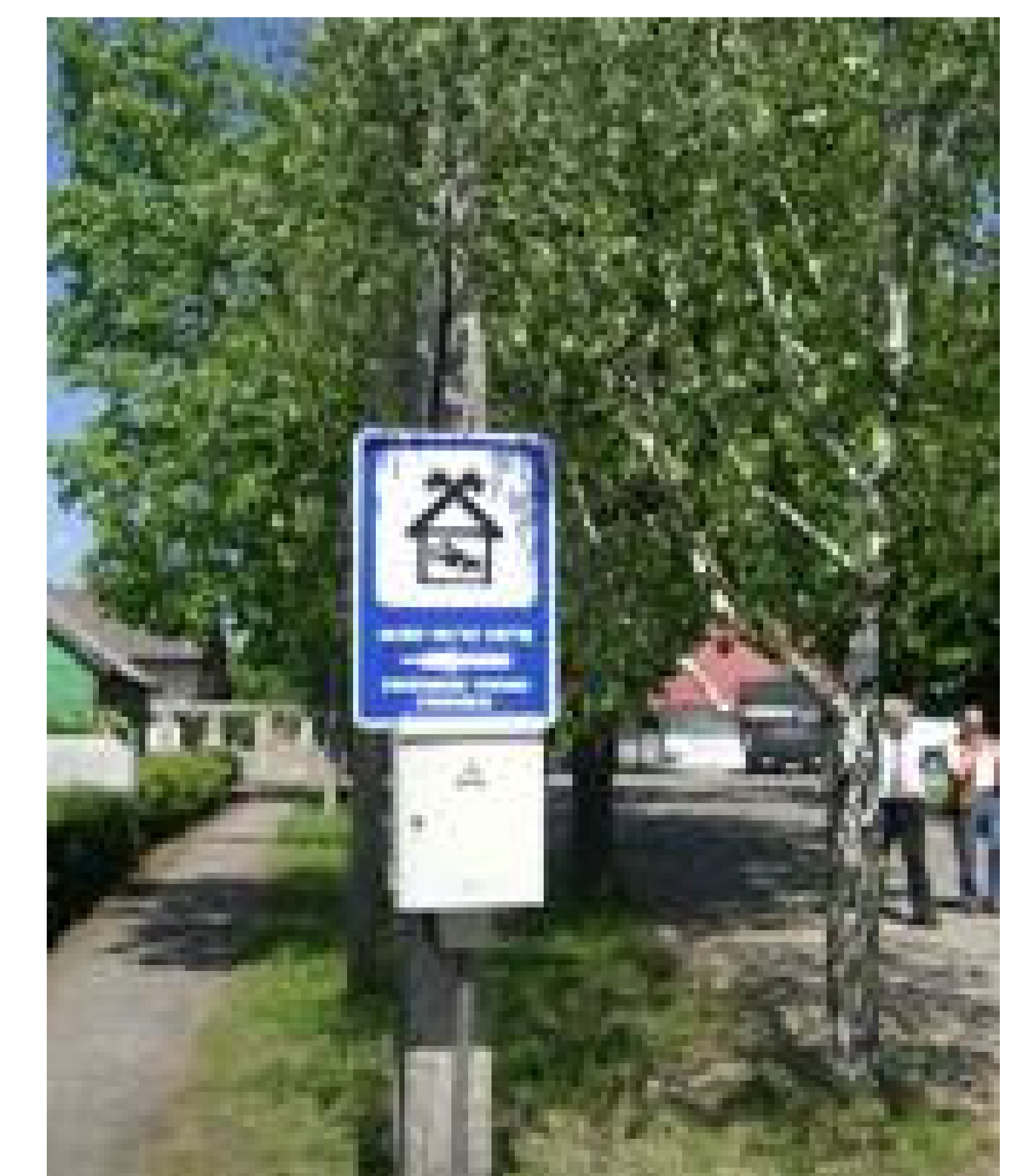
Reference toward rest and food