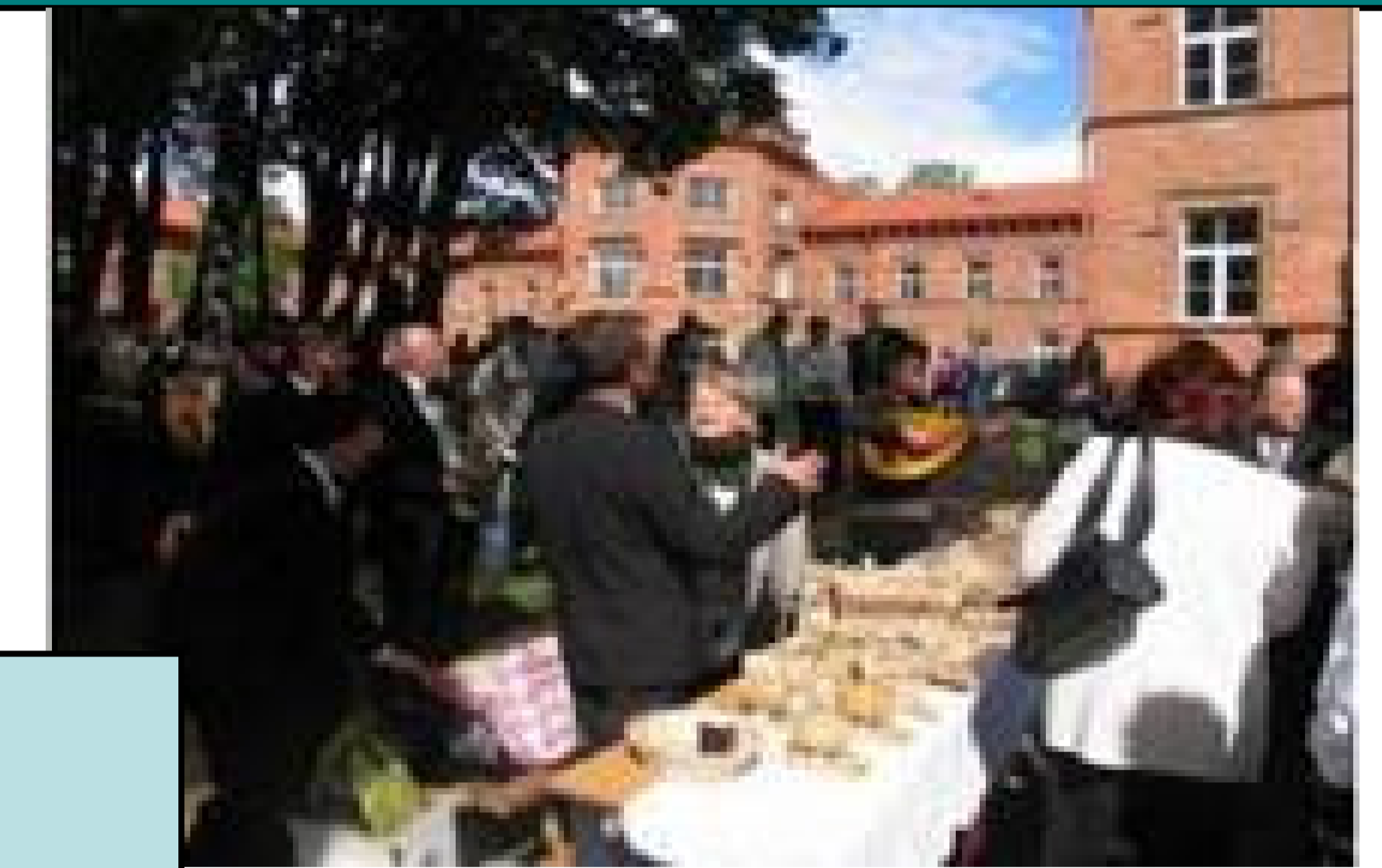
“In Panemunė blooms”...