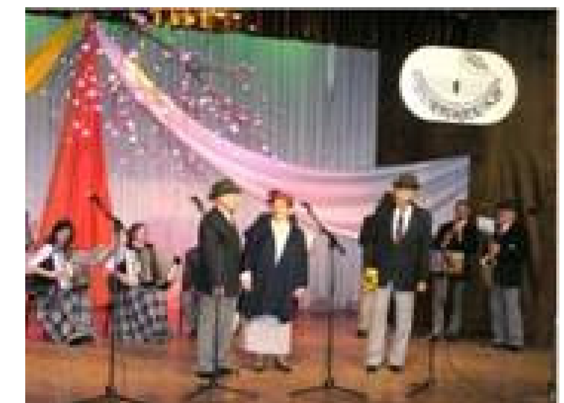
Moments from cultural life