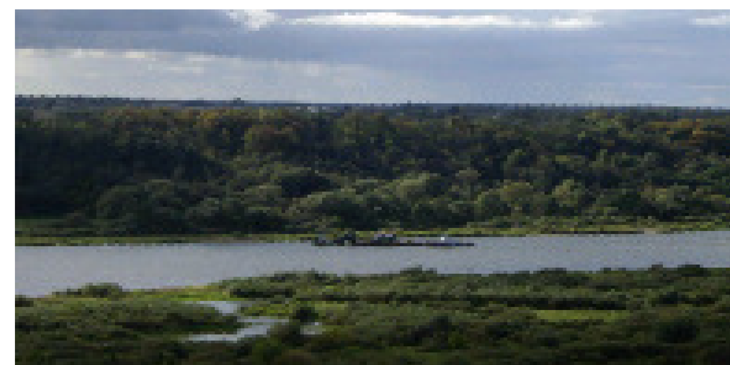
Non realized potential