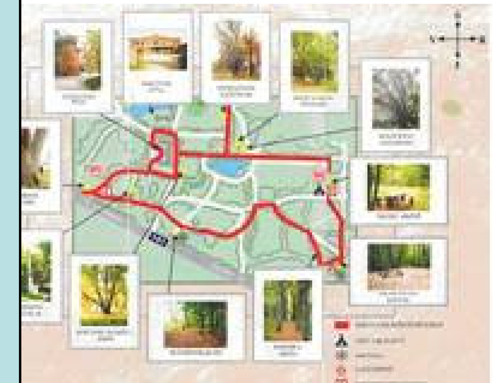
Most attended places in Raudonė