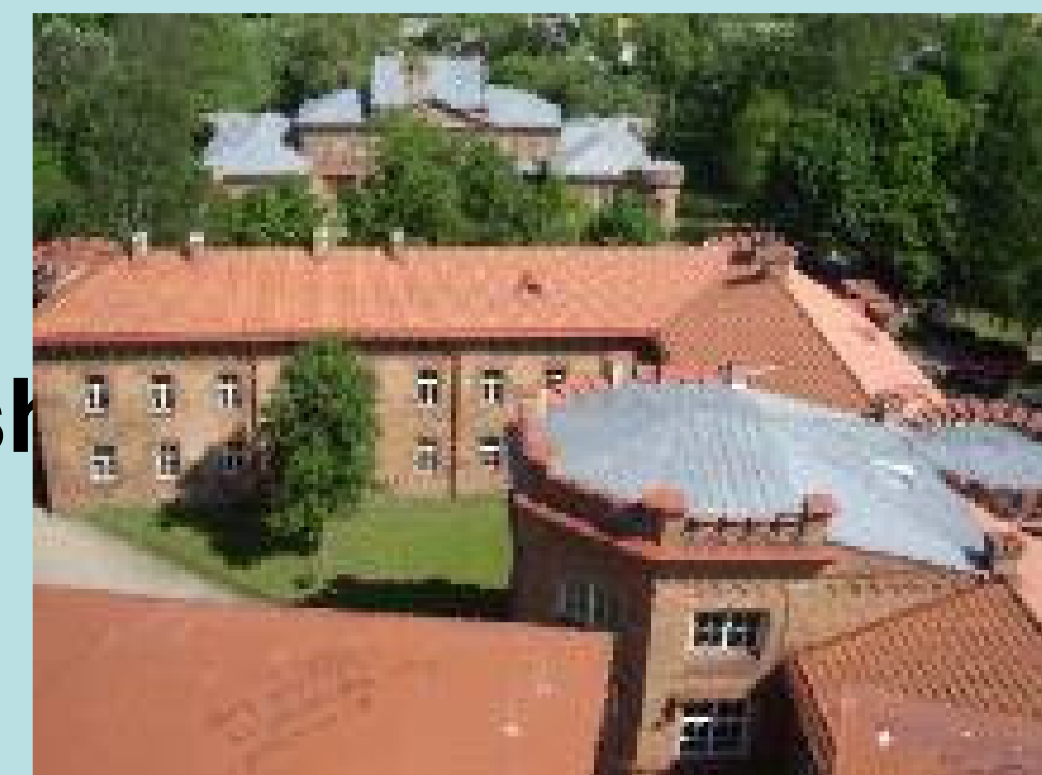
Raudonė castle – our stronghold