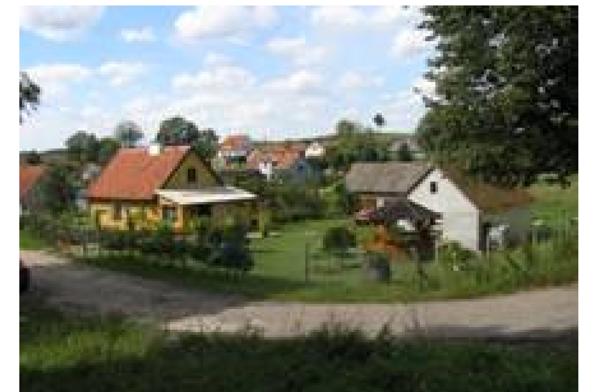
New gardens with aesthetic view