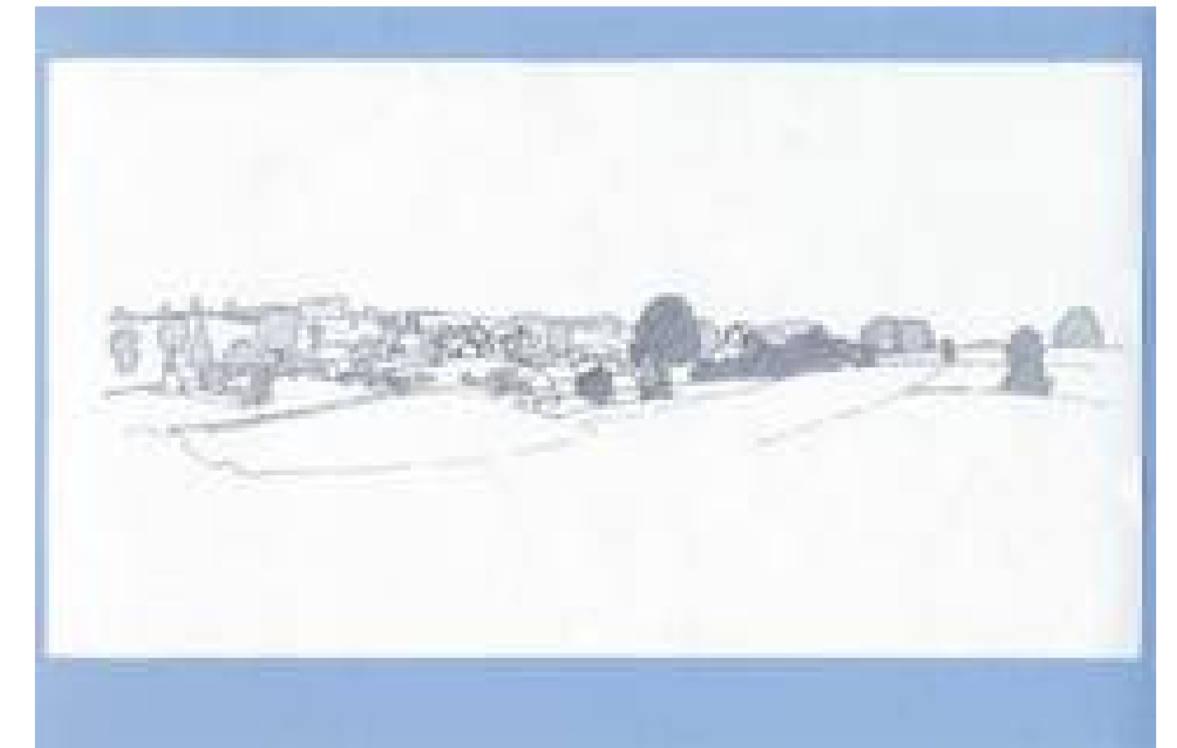
The inventory of village, 2006