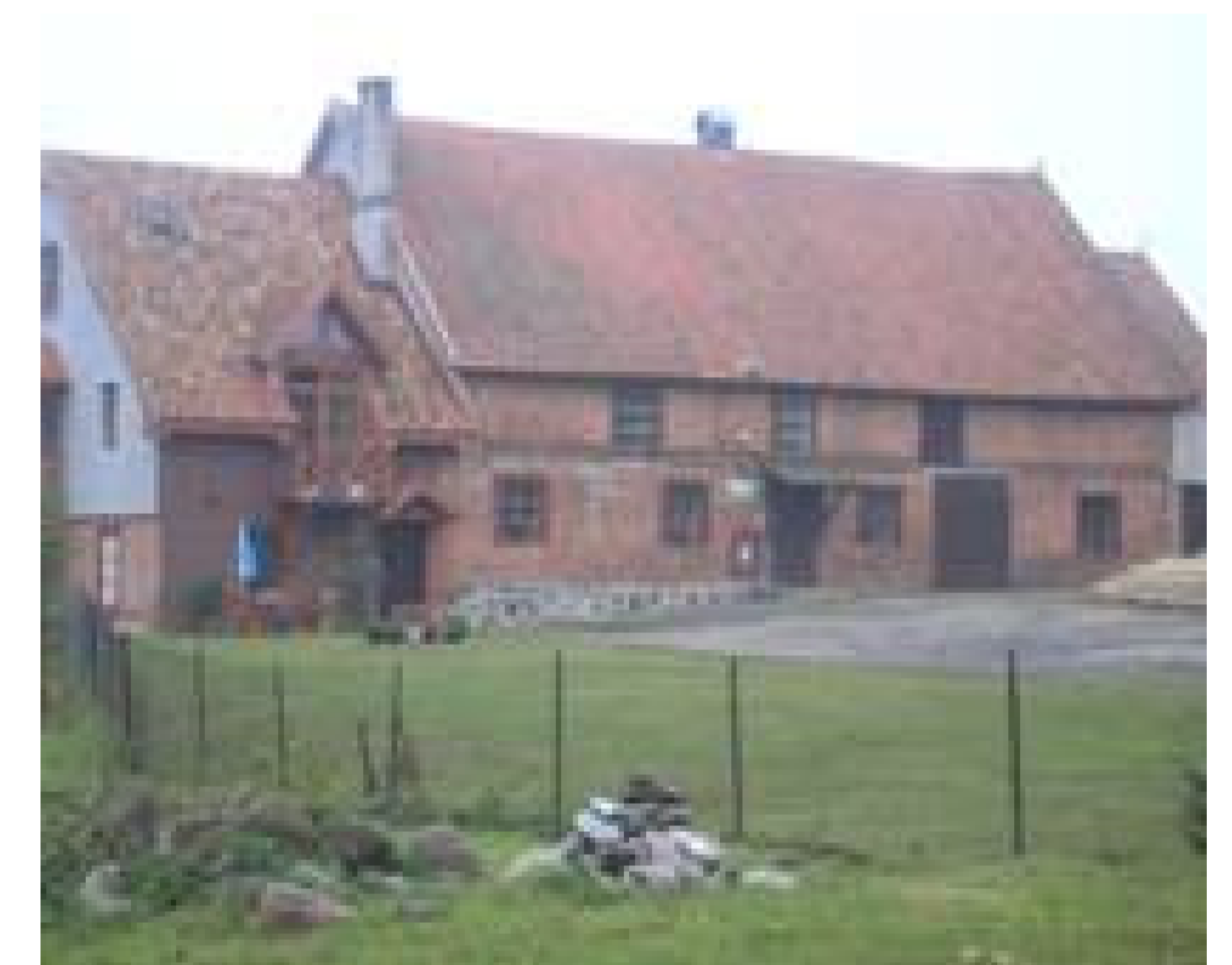
New enterprise in the village