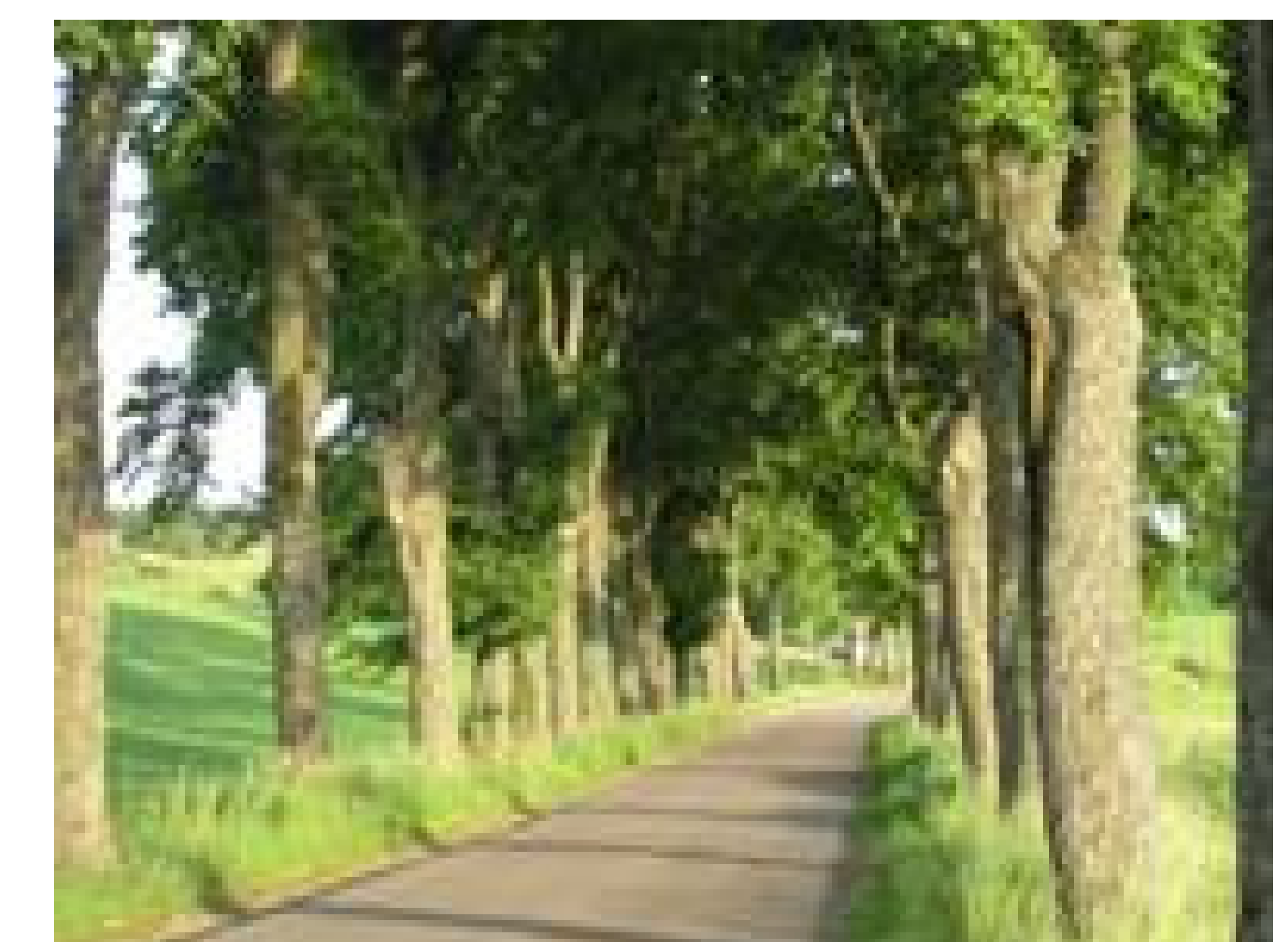
Tree aleey „Tilia cordata”