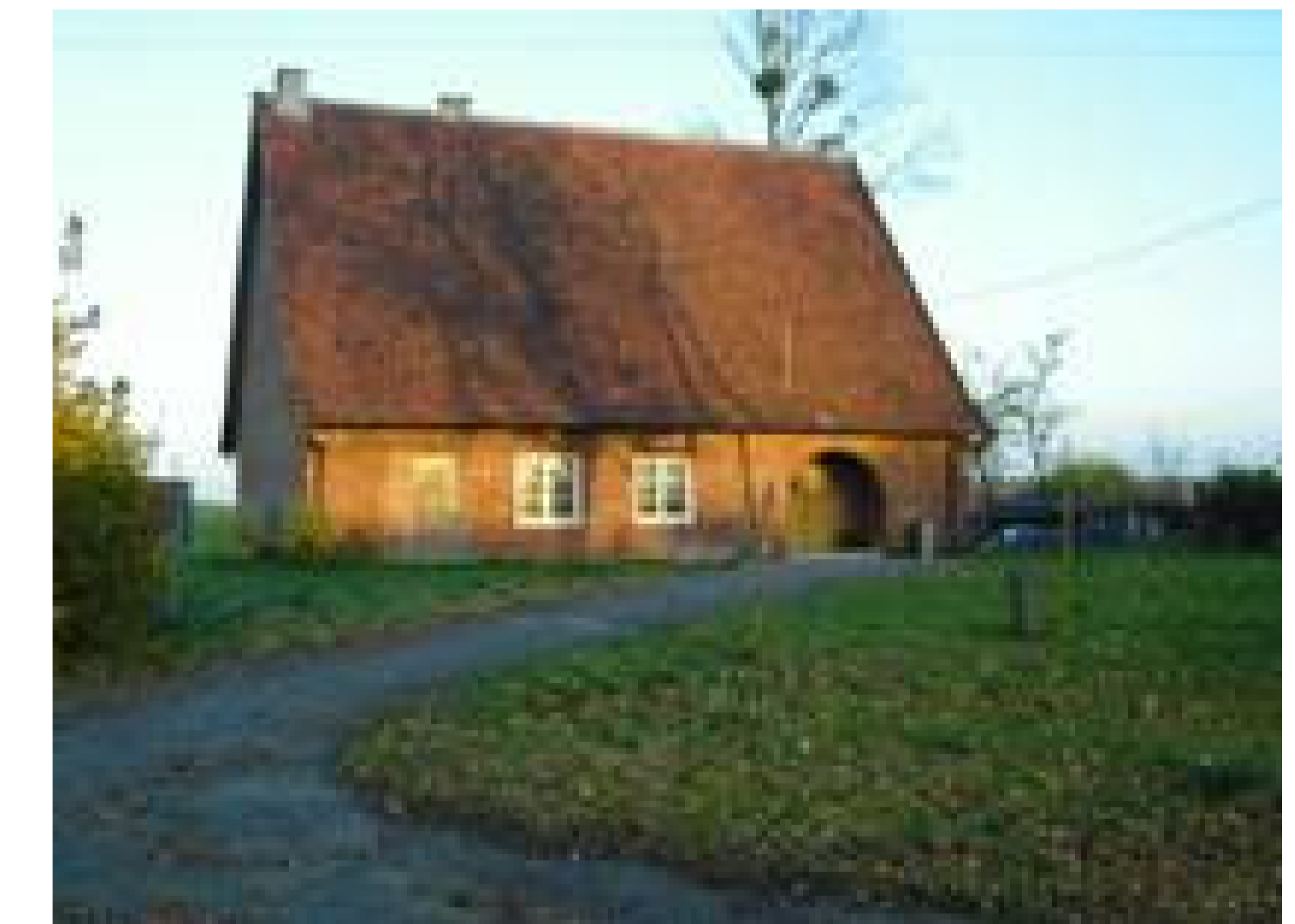
The village club