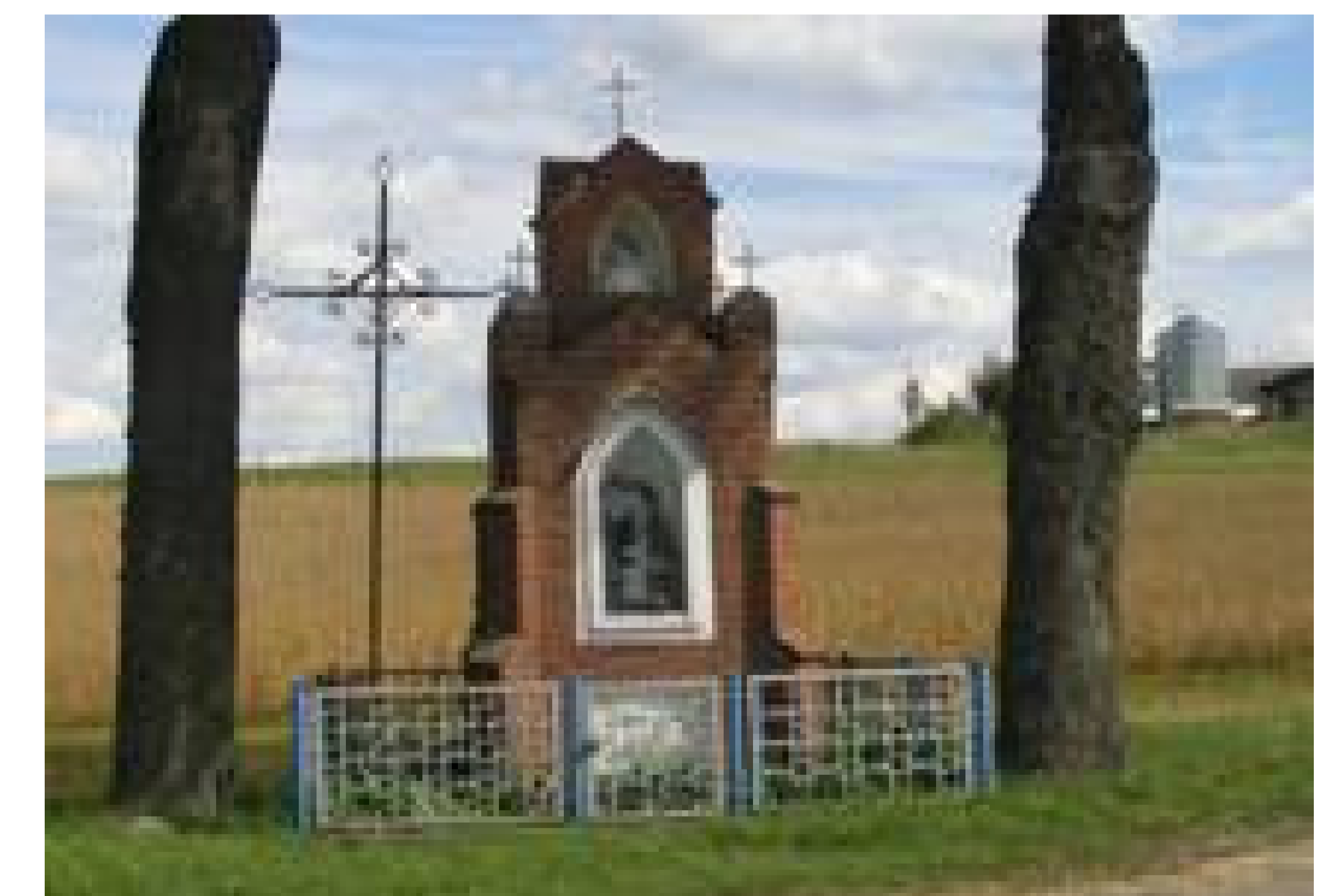
Renovation of old chapels