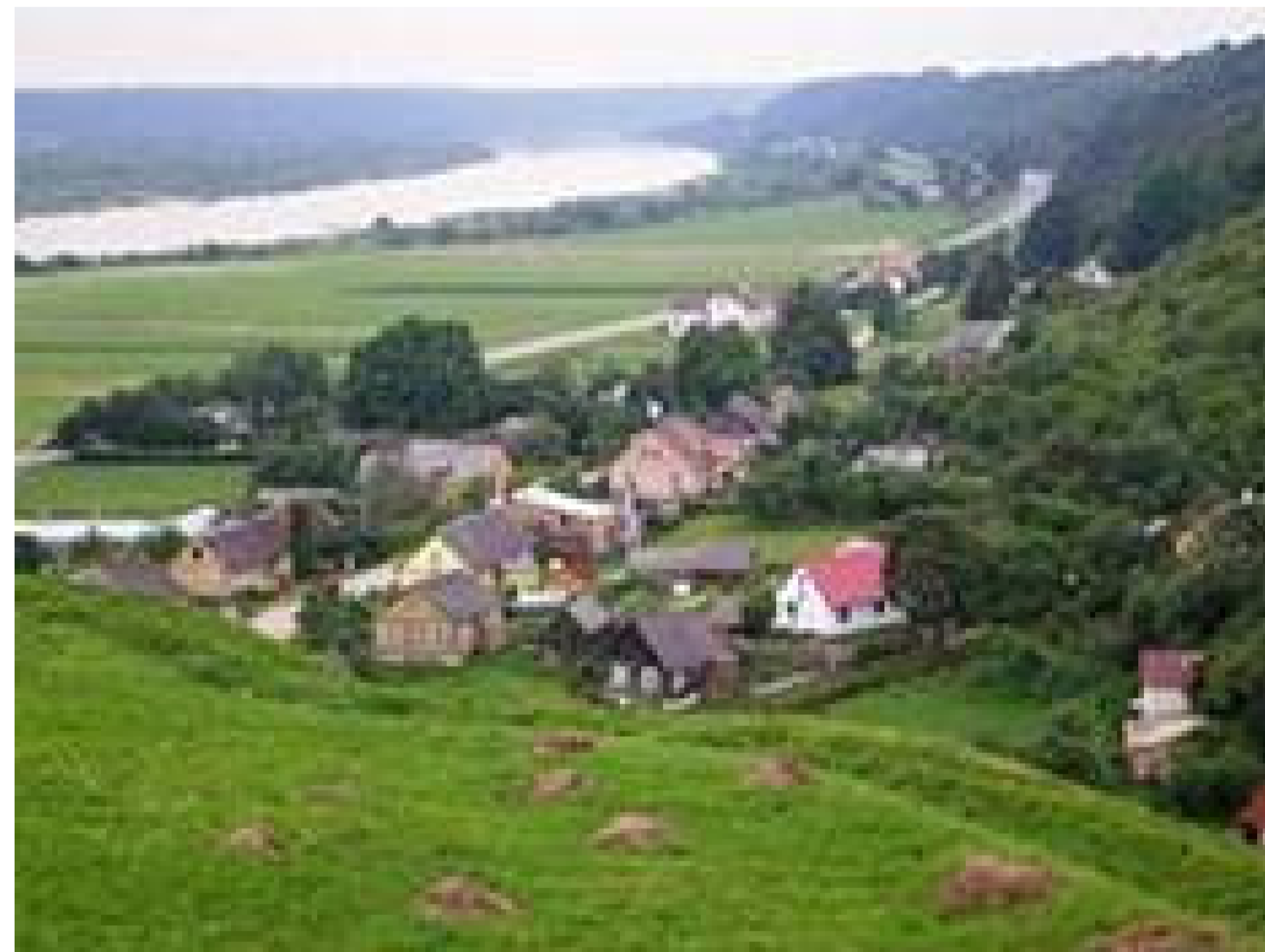
Seredžius from Palemonas hill