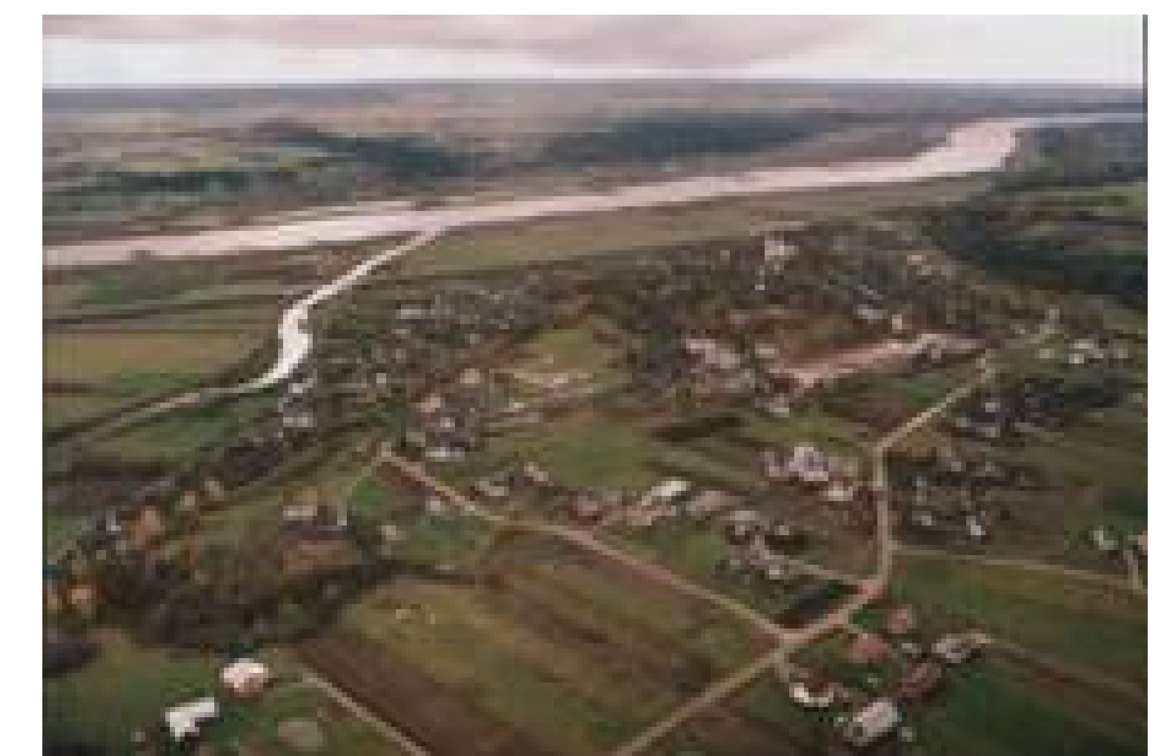
Special part in Seredžiaus area goes to Nemunas vale