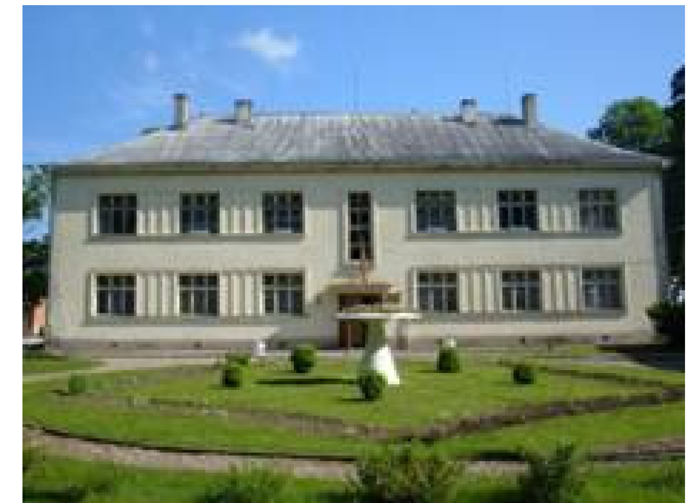
Seredžiaus basic school