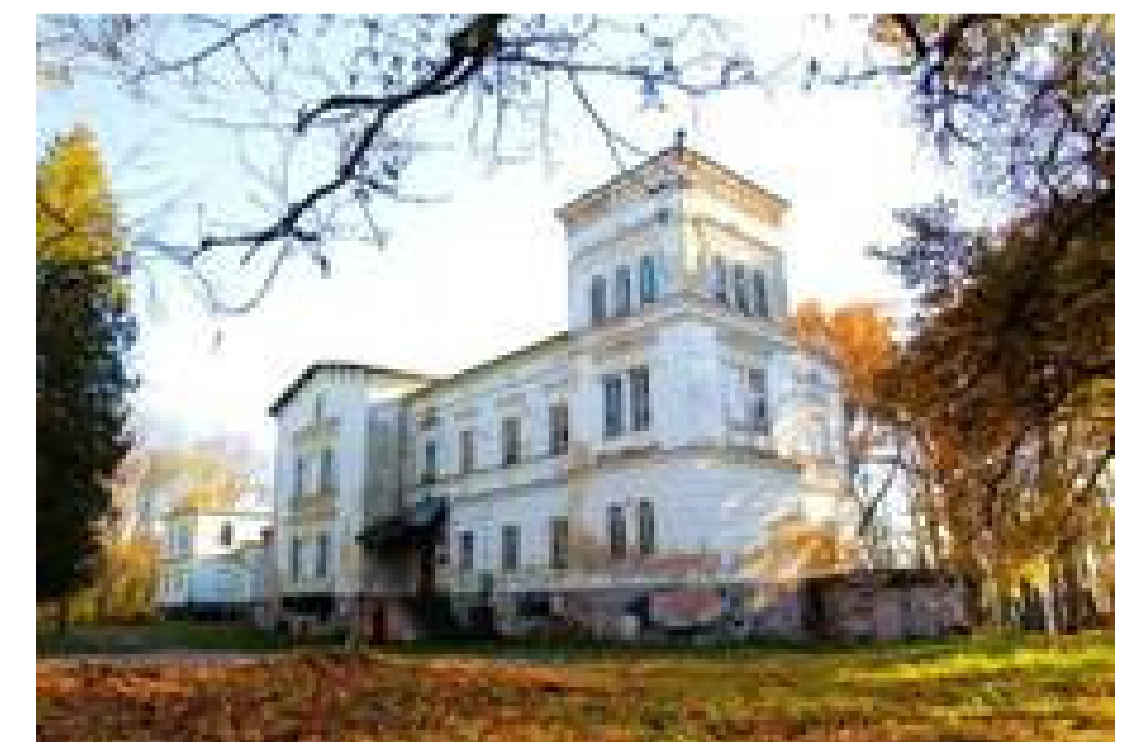
Ensemble of Belvederis chamber is Lithuanian architectural monument