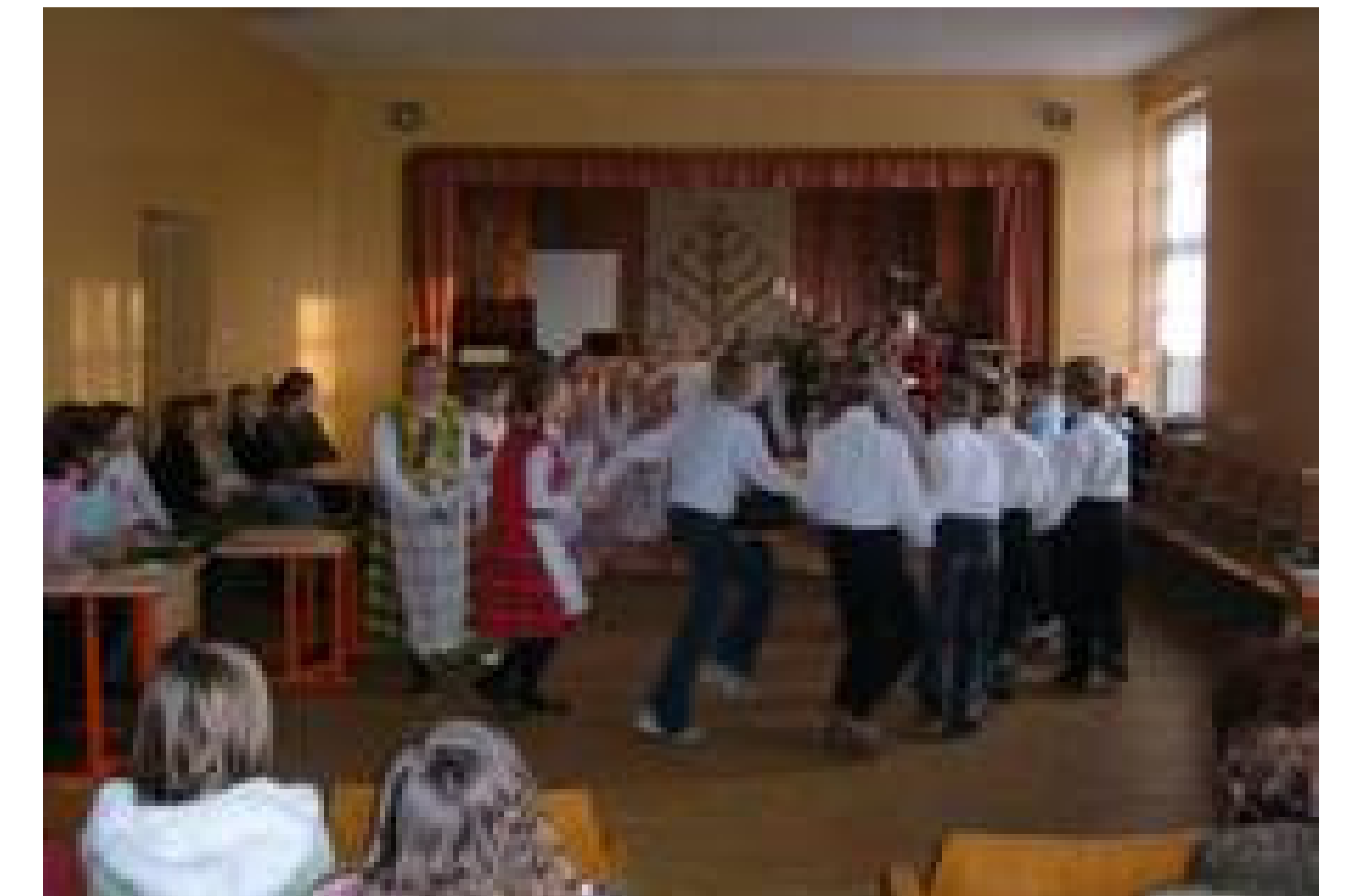
Seredžius school folklore ensemble

40 years, each year take place the most beautiful homestead elections.