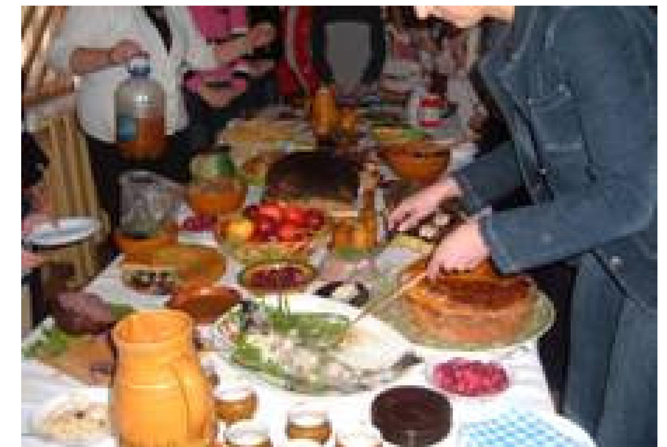
„Cultural heritage of Seredžius land”