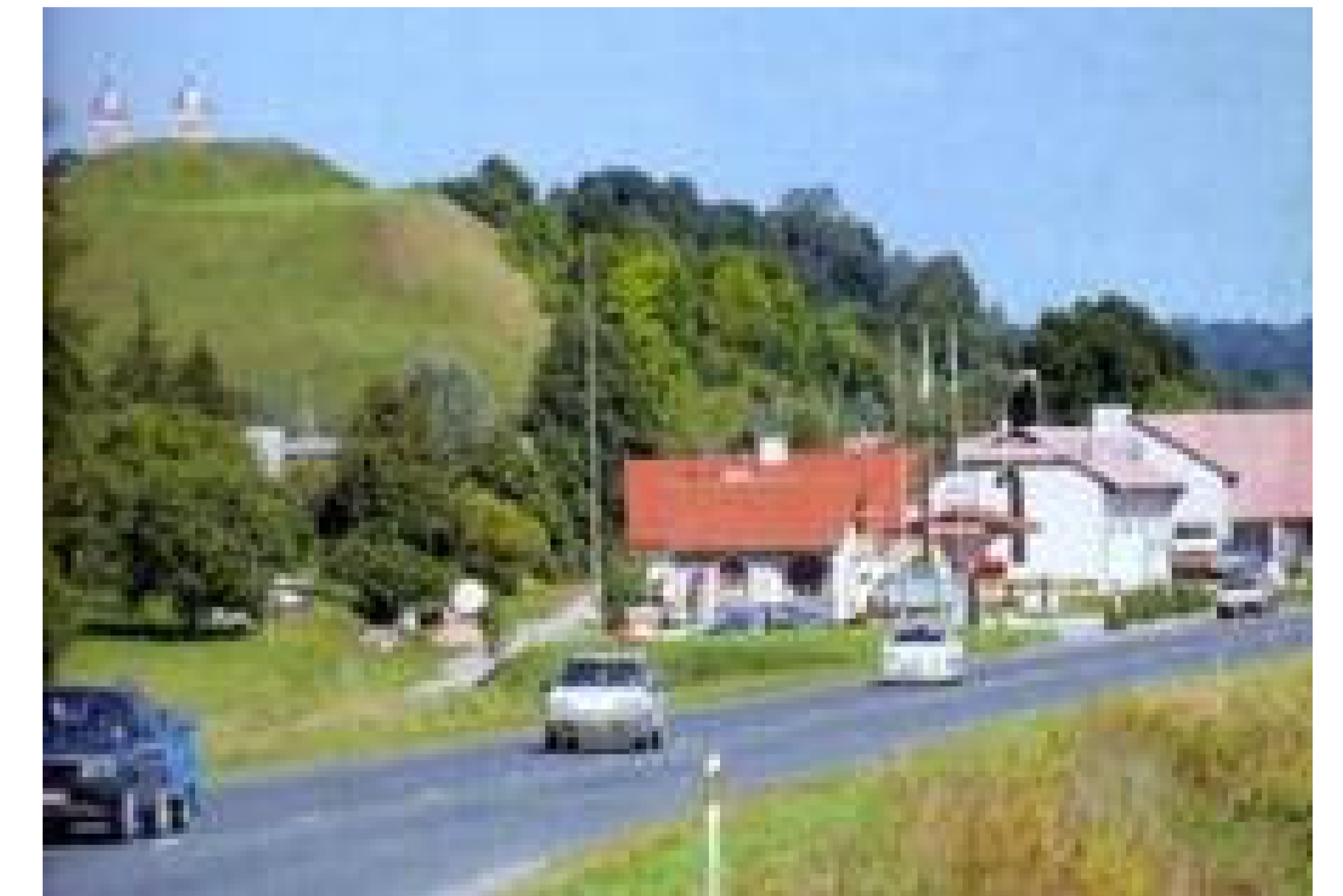
Seredžius (Palemonas hill) mound