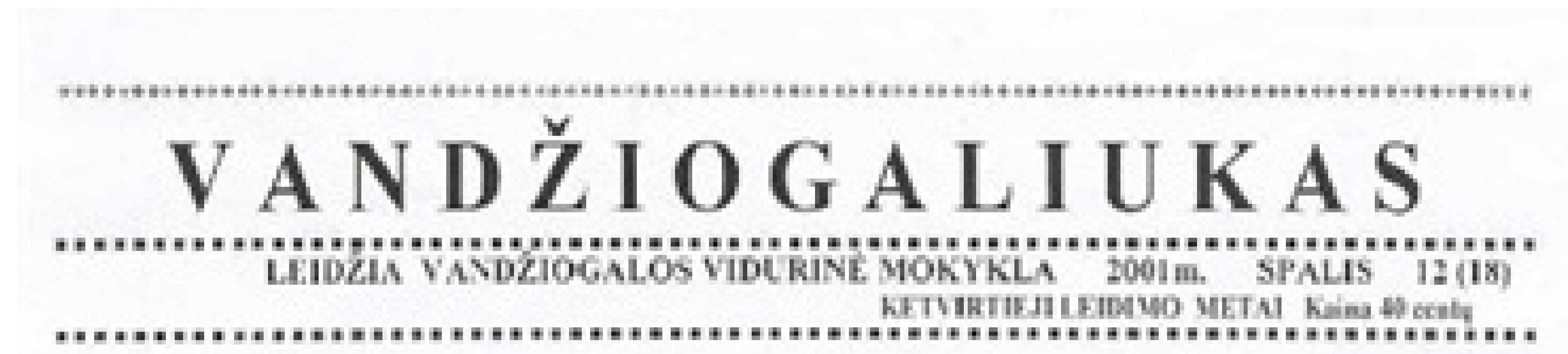
Newspaper of Vandžiogala youth

Moto: “ Holiday “campers”, please stop, admire and have a rest! ”