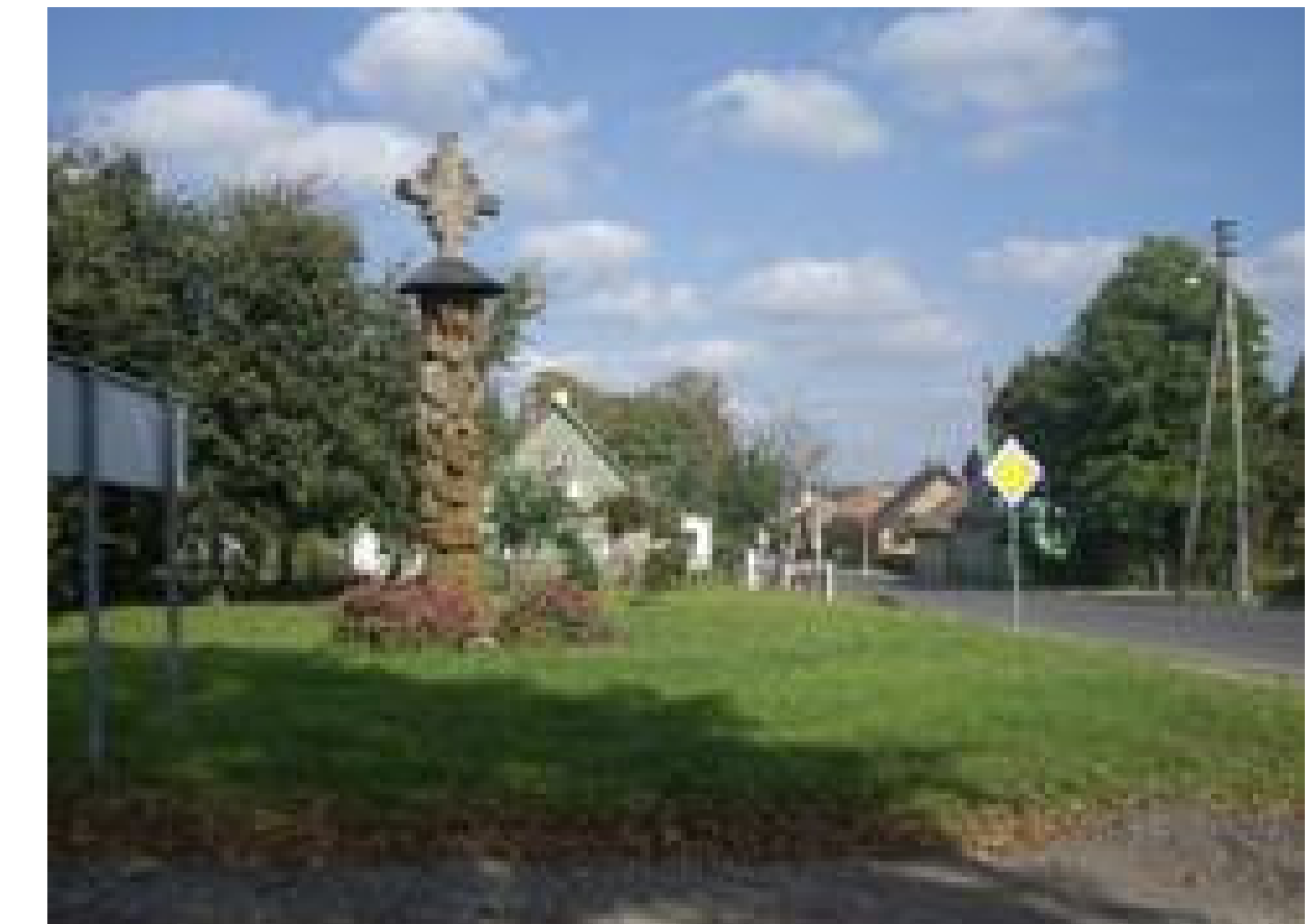
Street of Vandžiogala