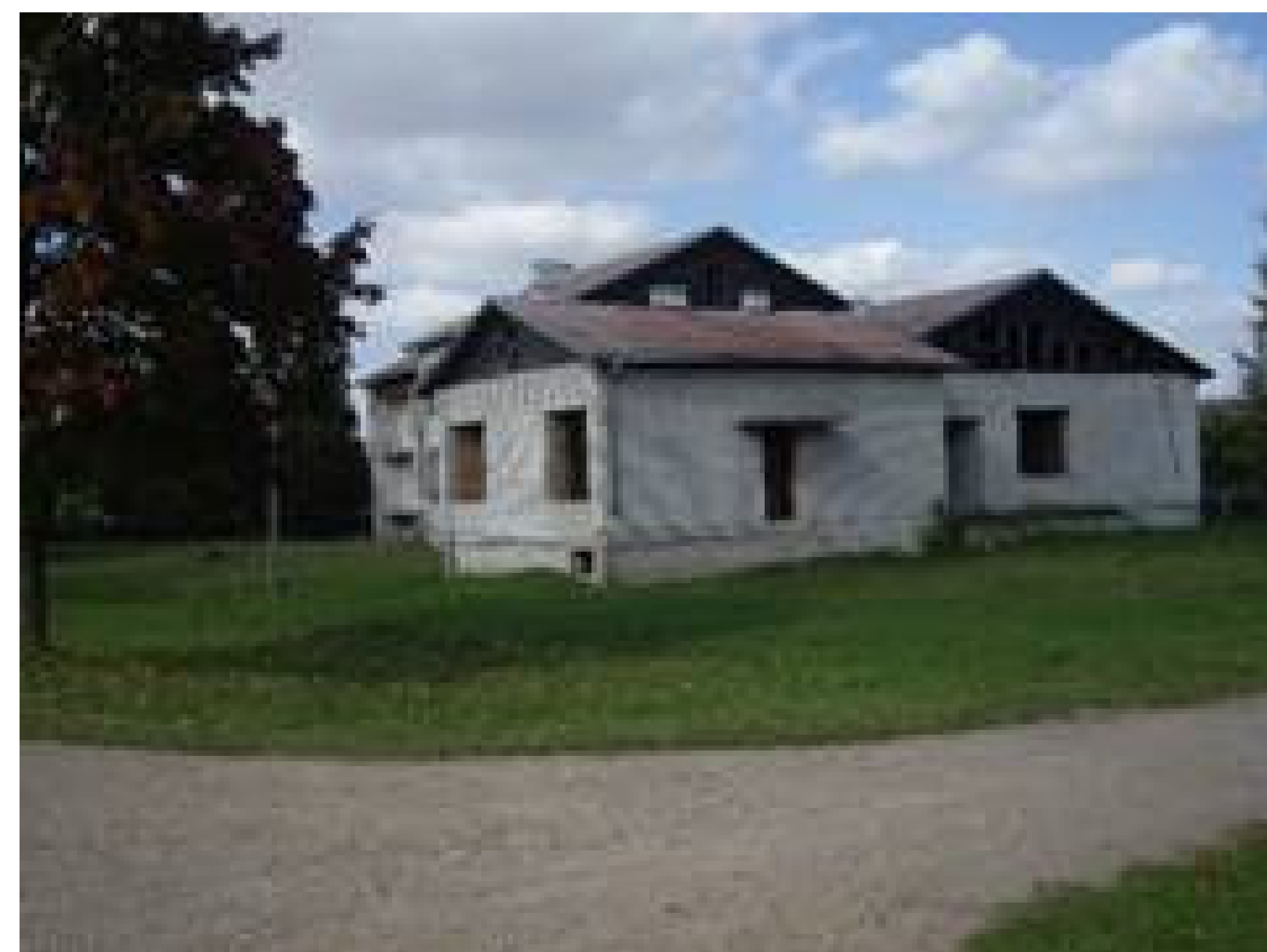
Seeking to use the potential "house-ghost"