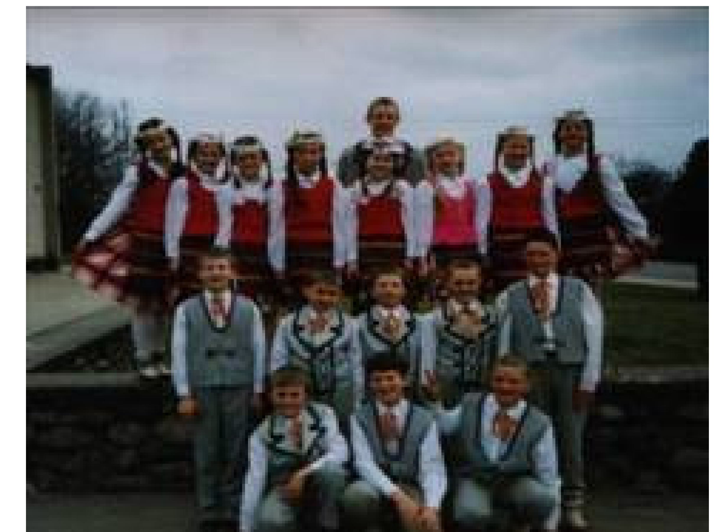
Children nation dancing collective „Verpetukas“.