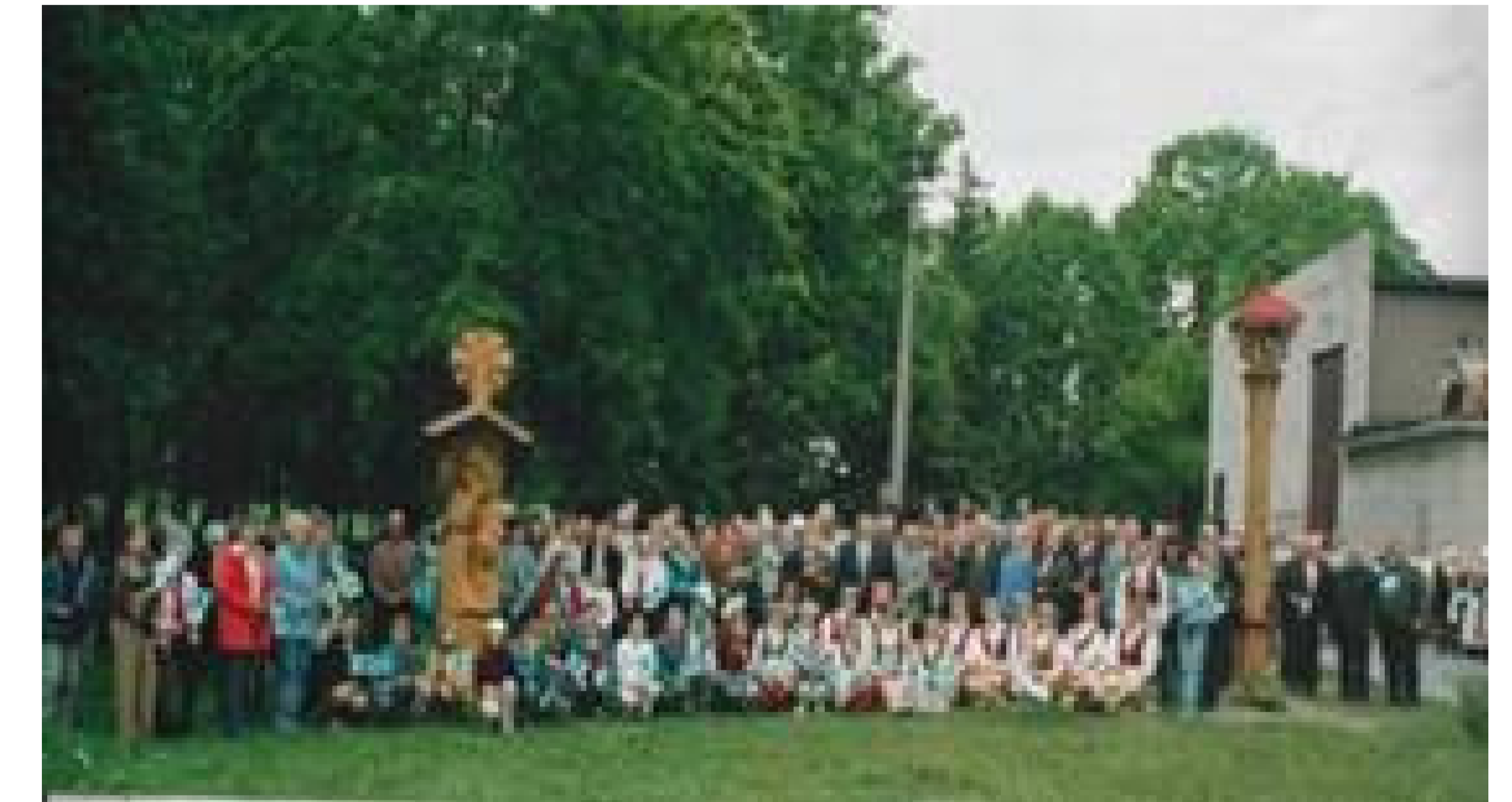
Vandžiogala's 620 year commemoration