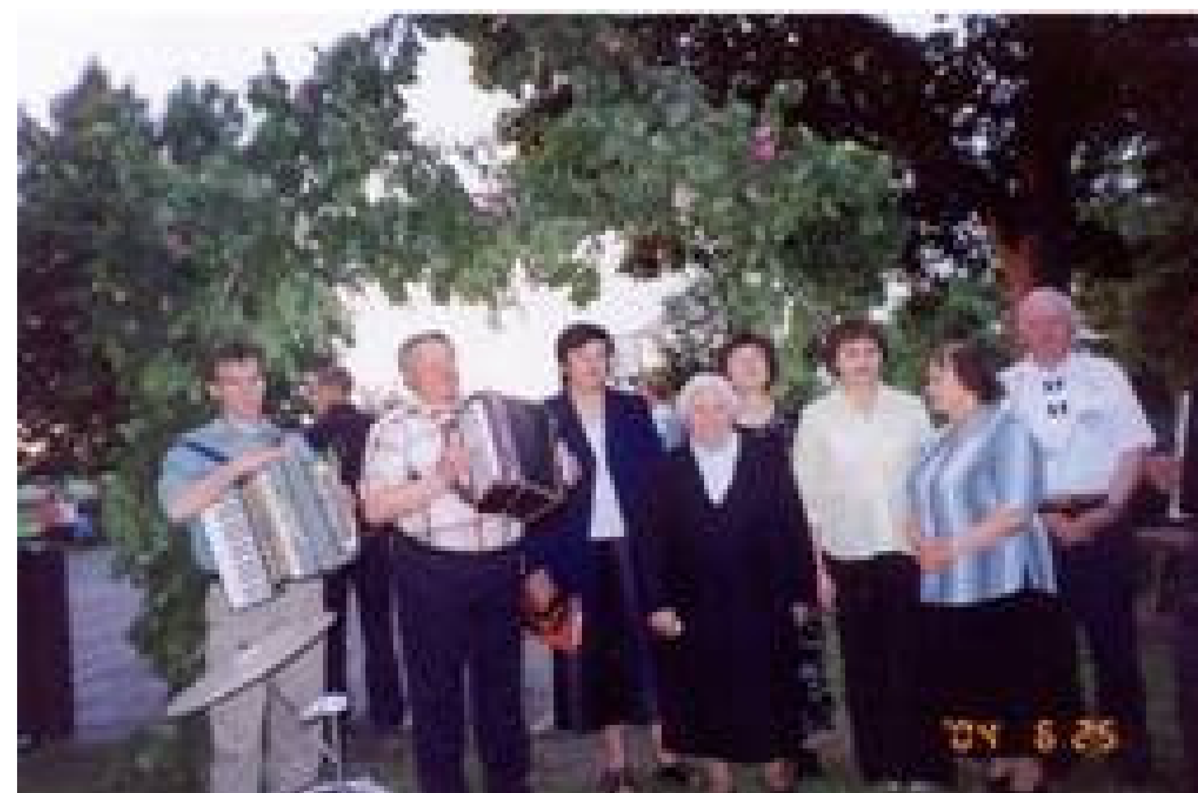
Village folksy chapel