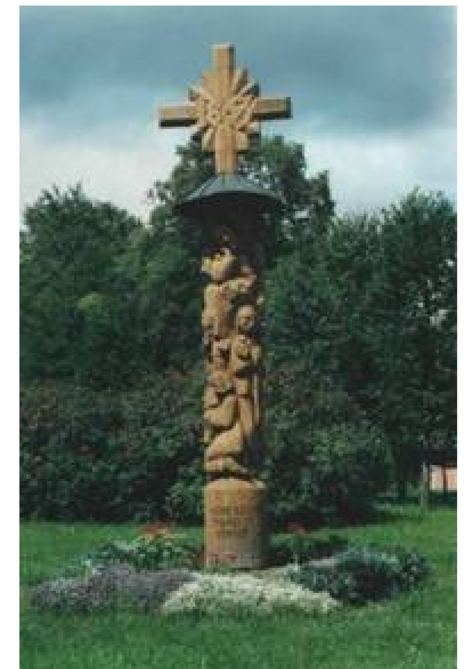
Chapel for commemoration of Ibėnai village tragedy