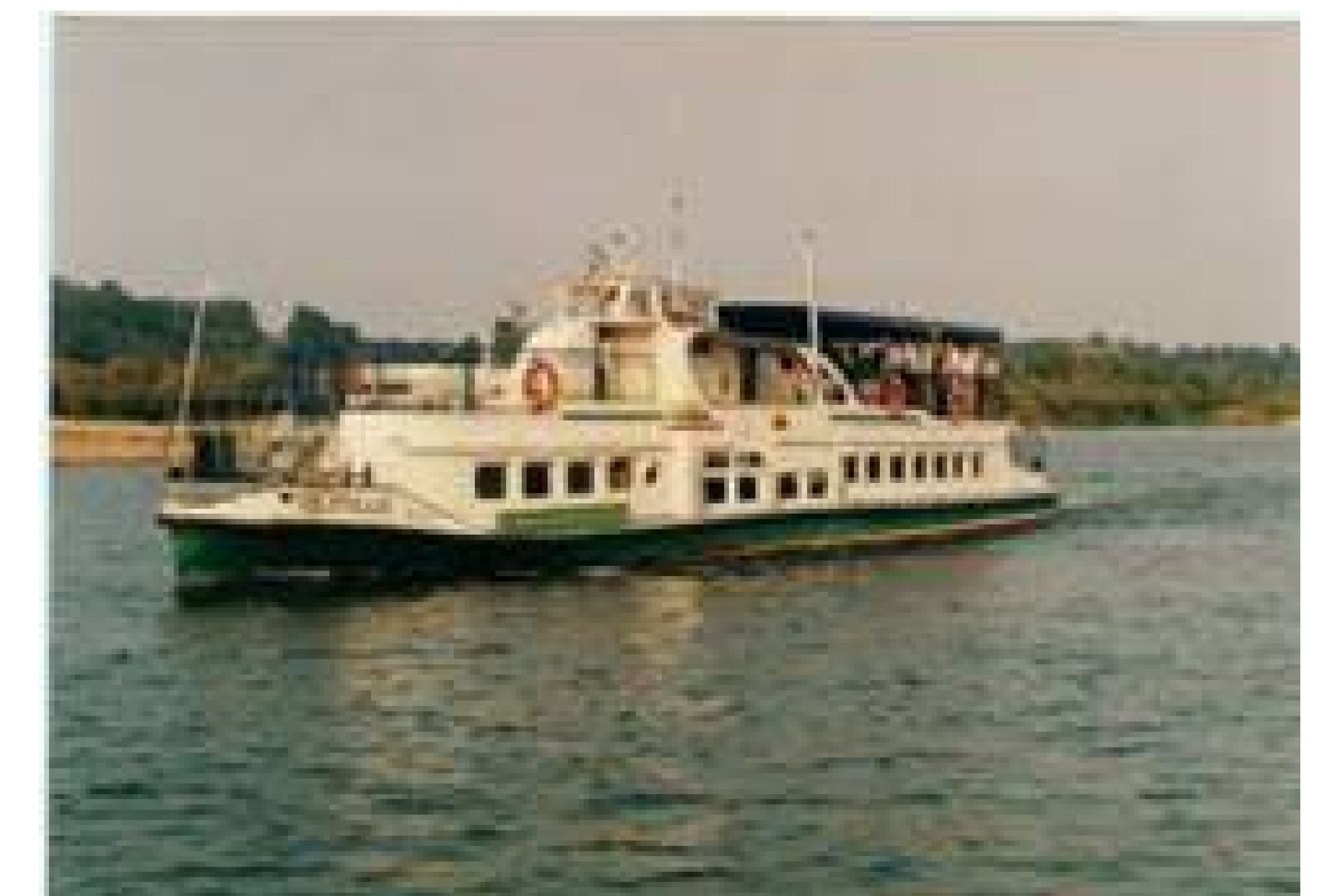
Water tourism (customer trip in the river Nemunas)