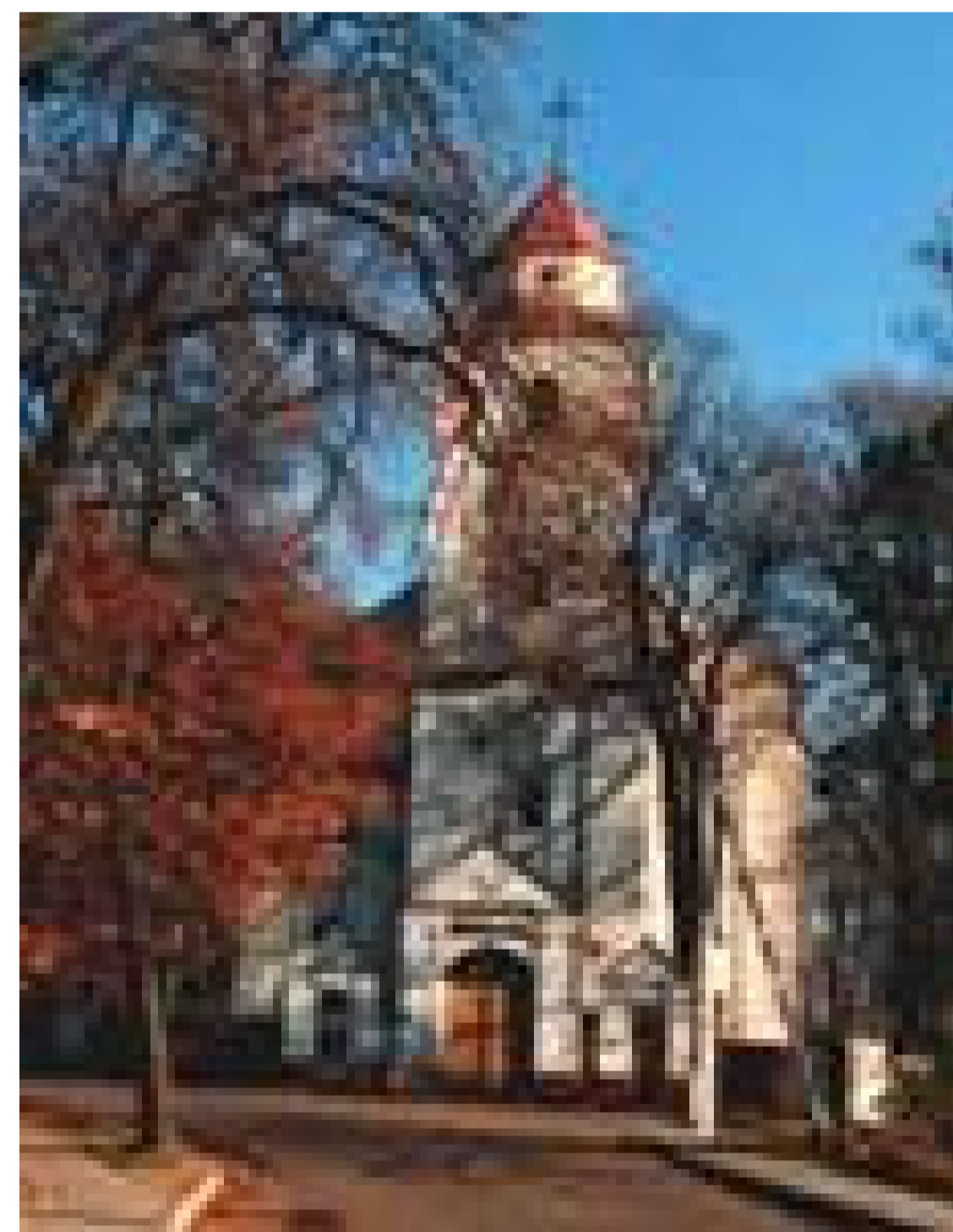
Blessed Virgin taking to heaven church in Veliuona