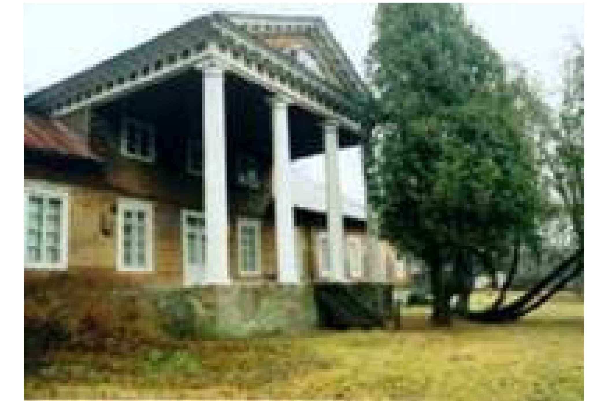
Museum of Veliuona land