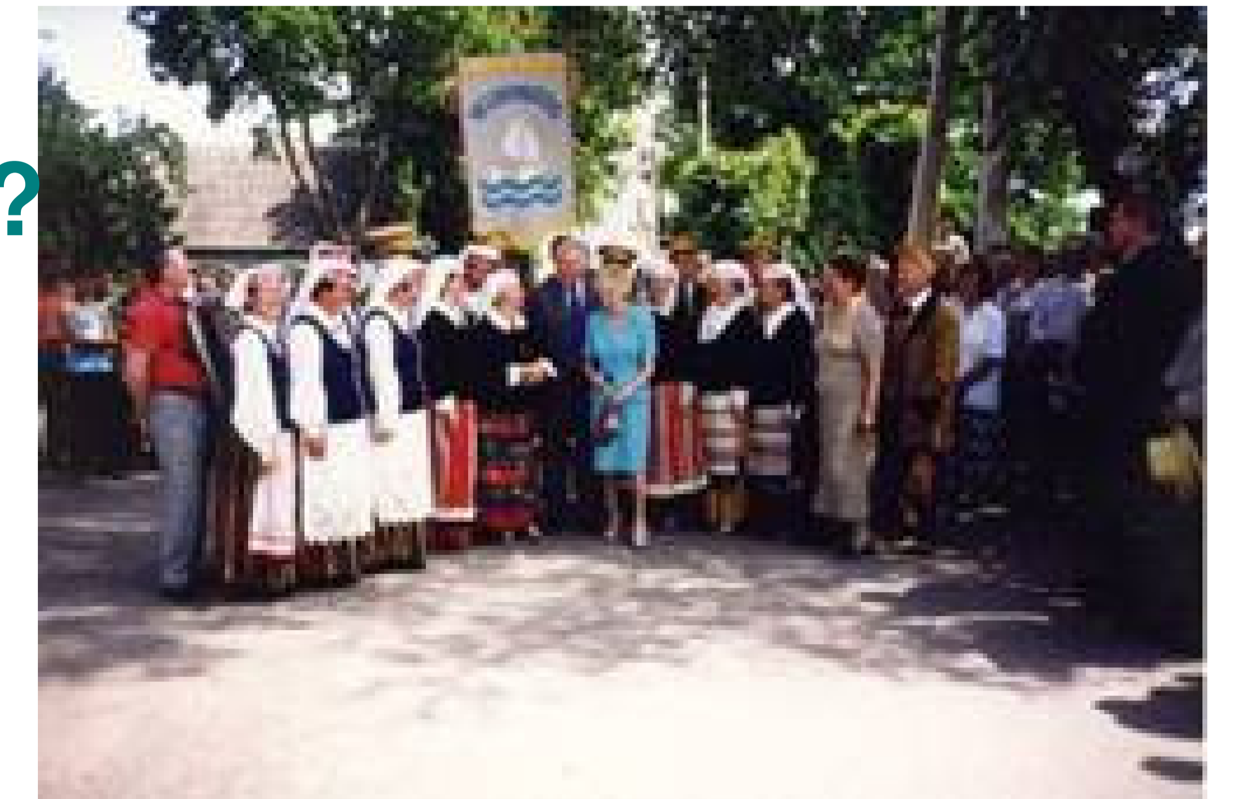
Stay oh His Excellency V. Adamkus