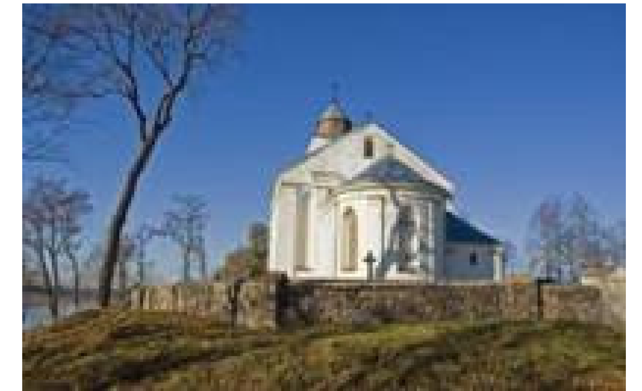
Blessed Virgin taking to heaven church in Veliuona