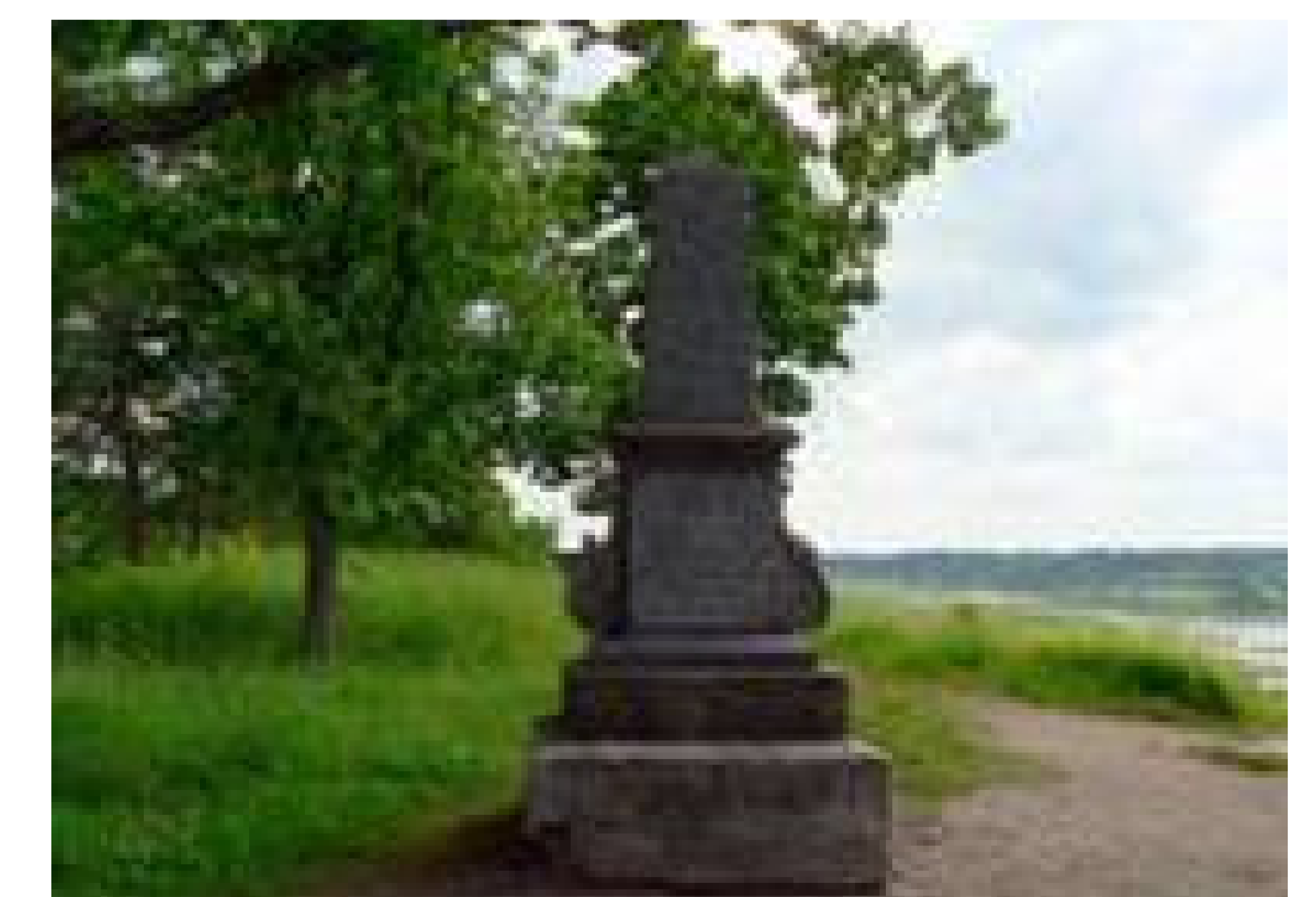
Memorial for Gediminas