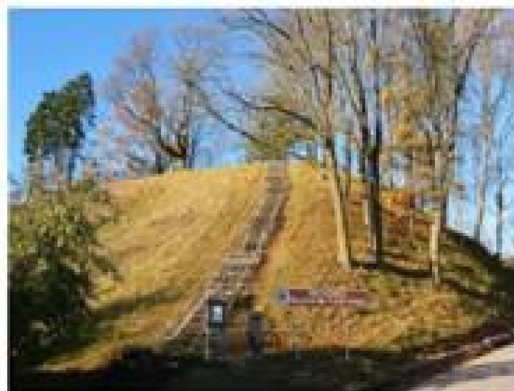
Gediminas grave mound