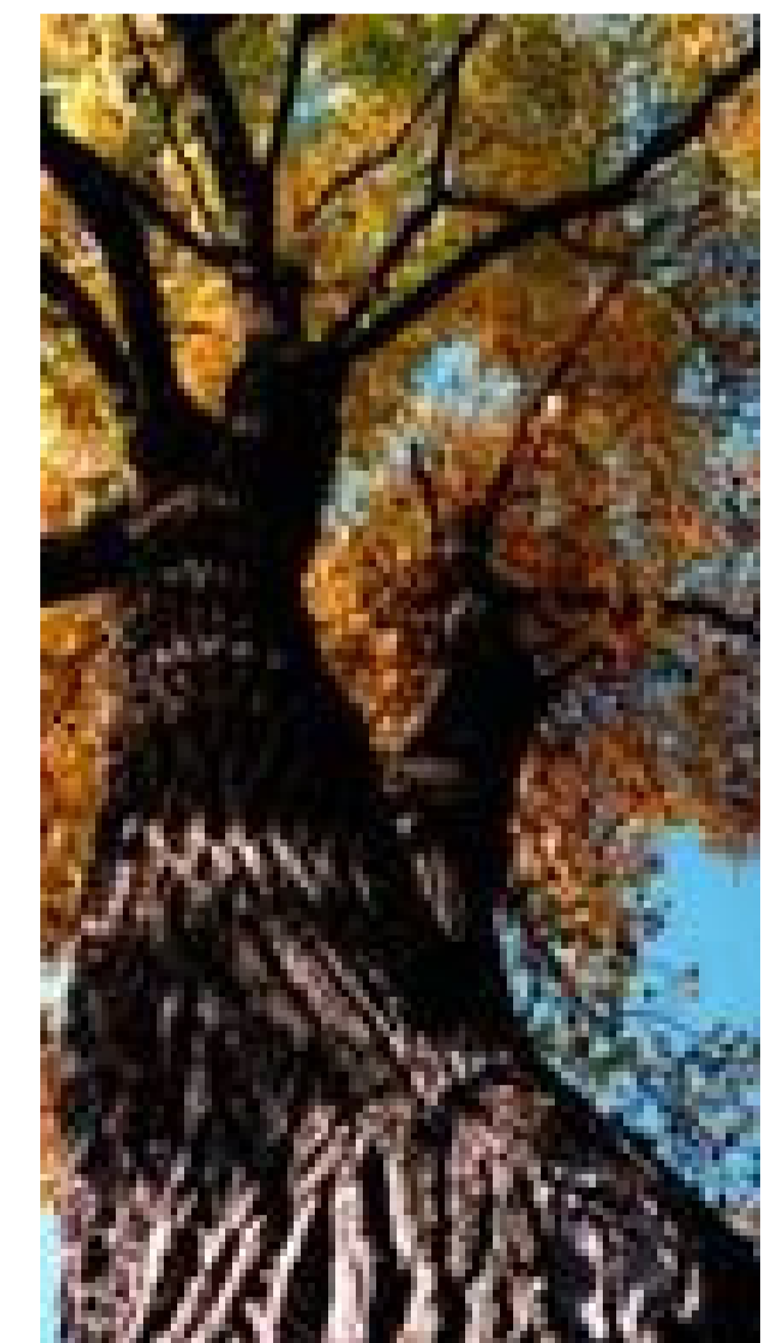
Park with old trees