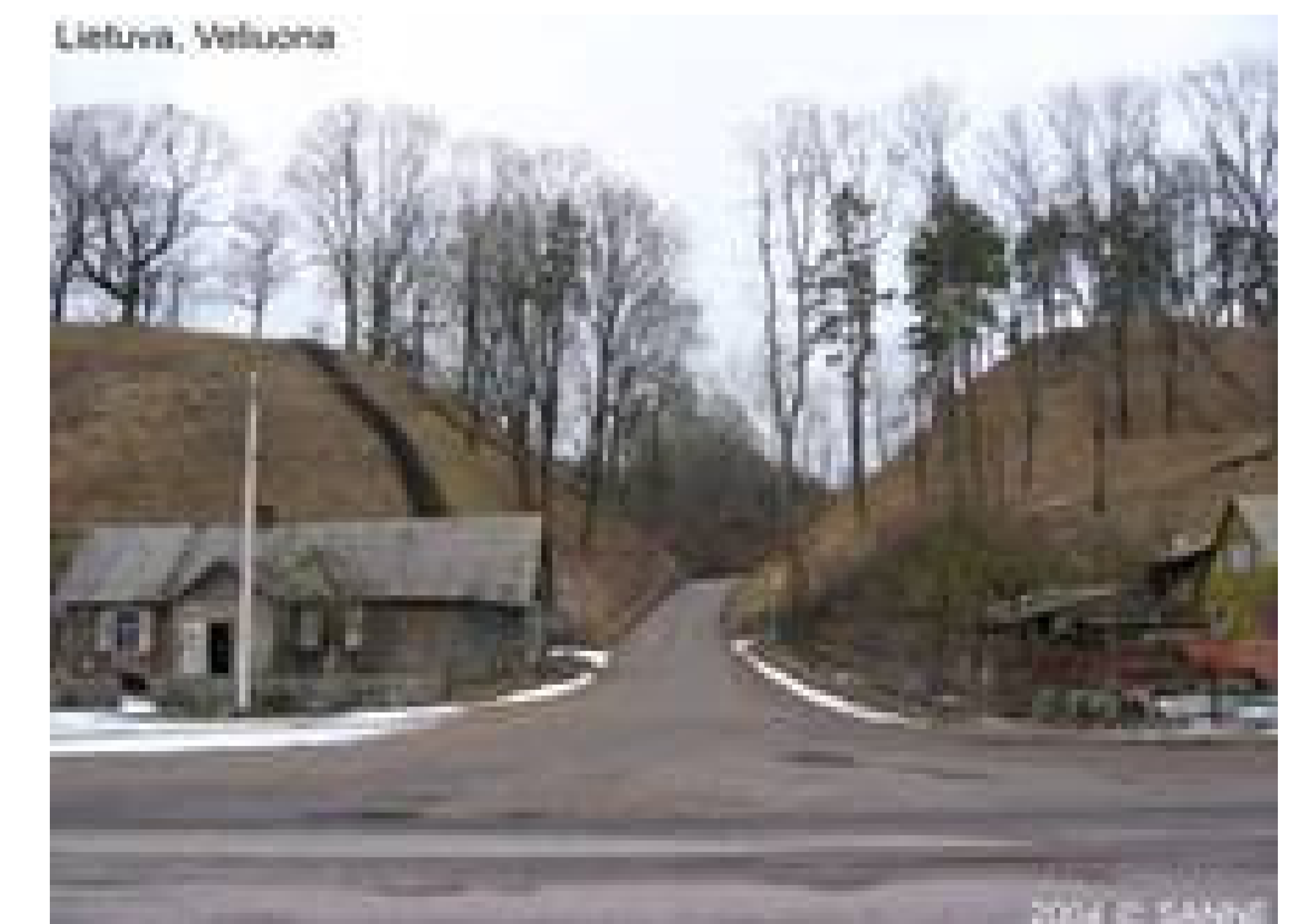
Main entrance to Veliuona