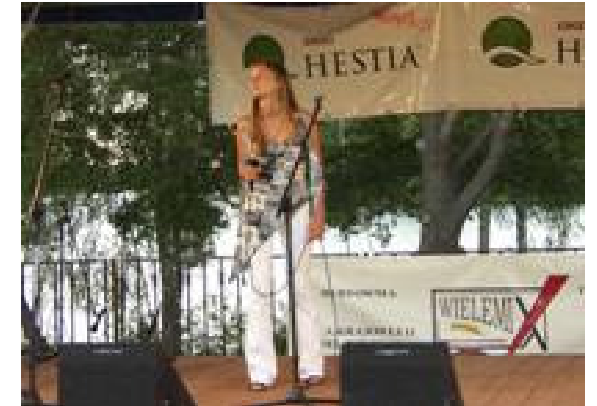
Yearly festival „Young Talents”