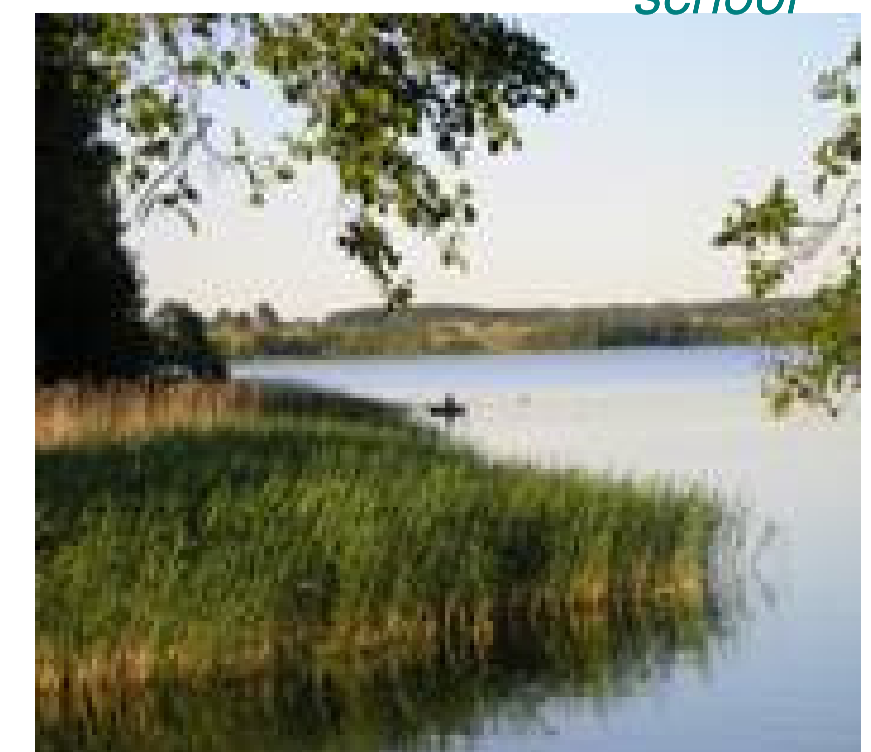
The Daday Lake near recreational zone