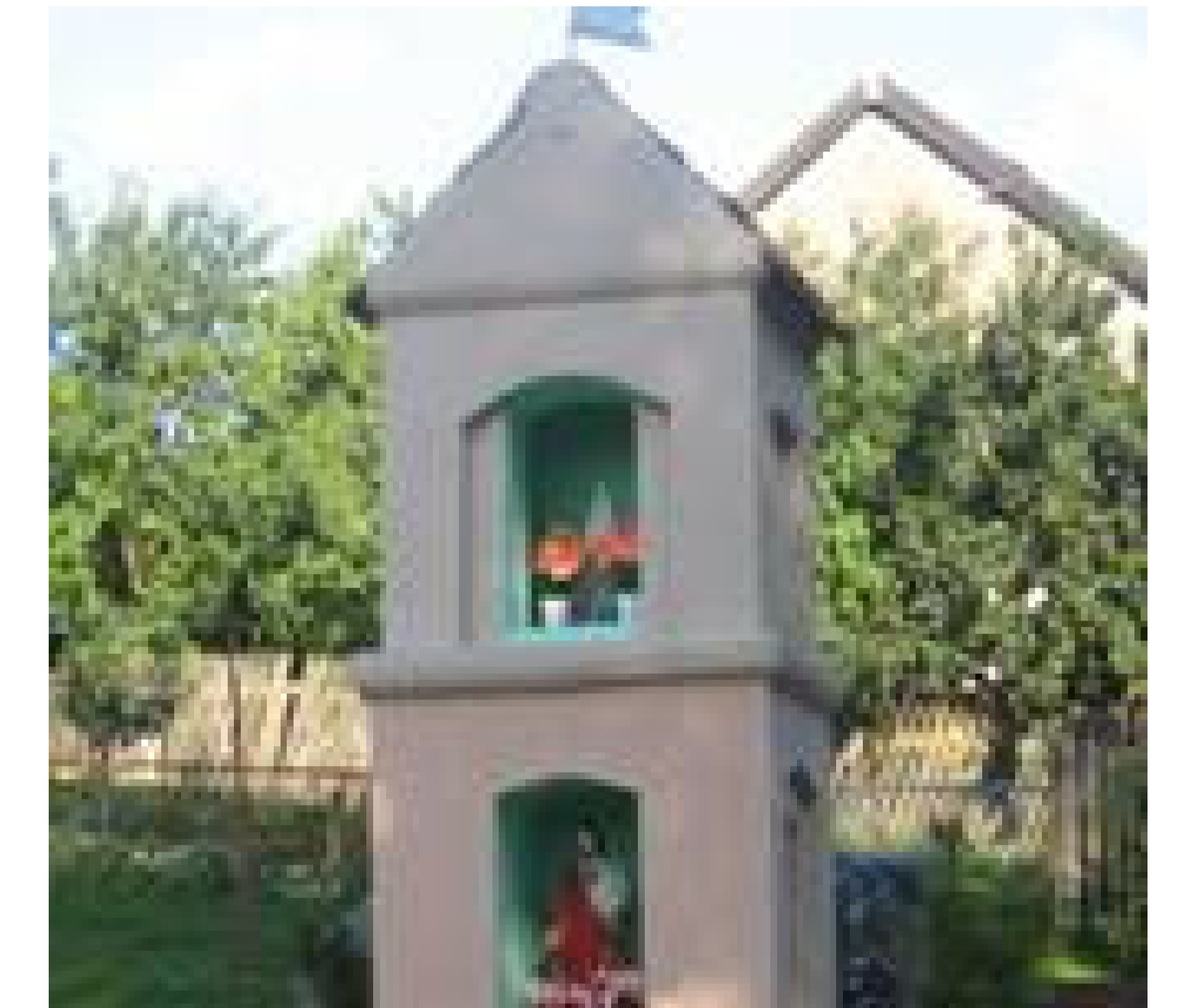
Little old chapels in village after renovation