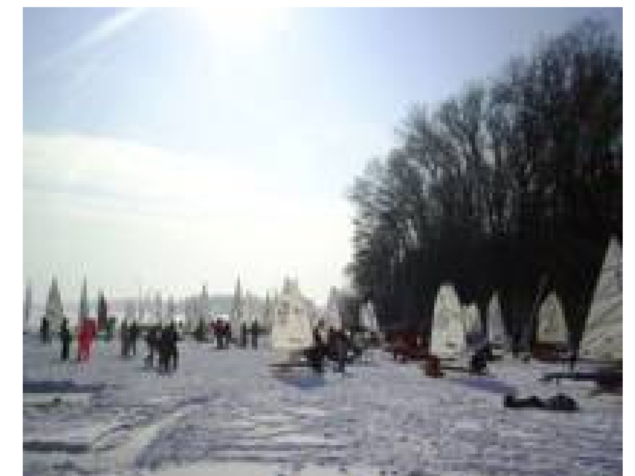
World and European Competition of ice-boats