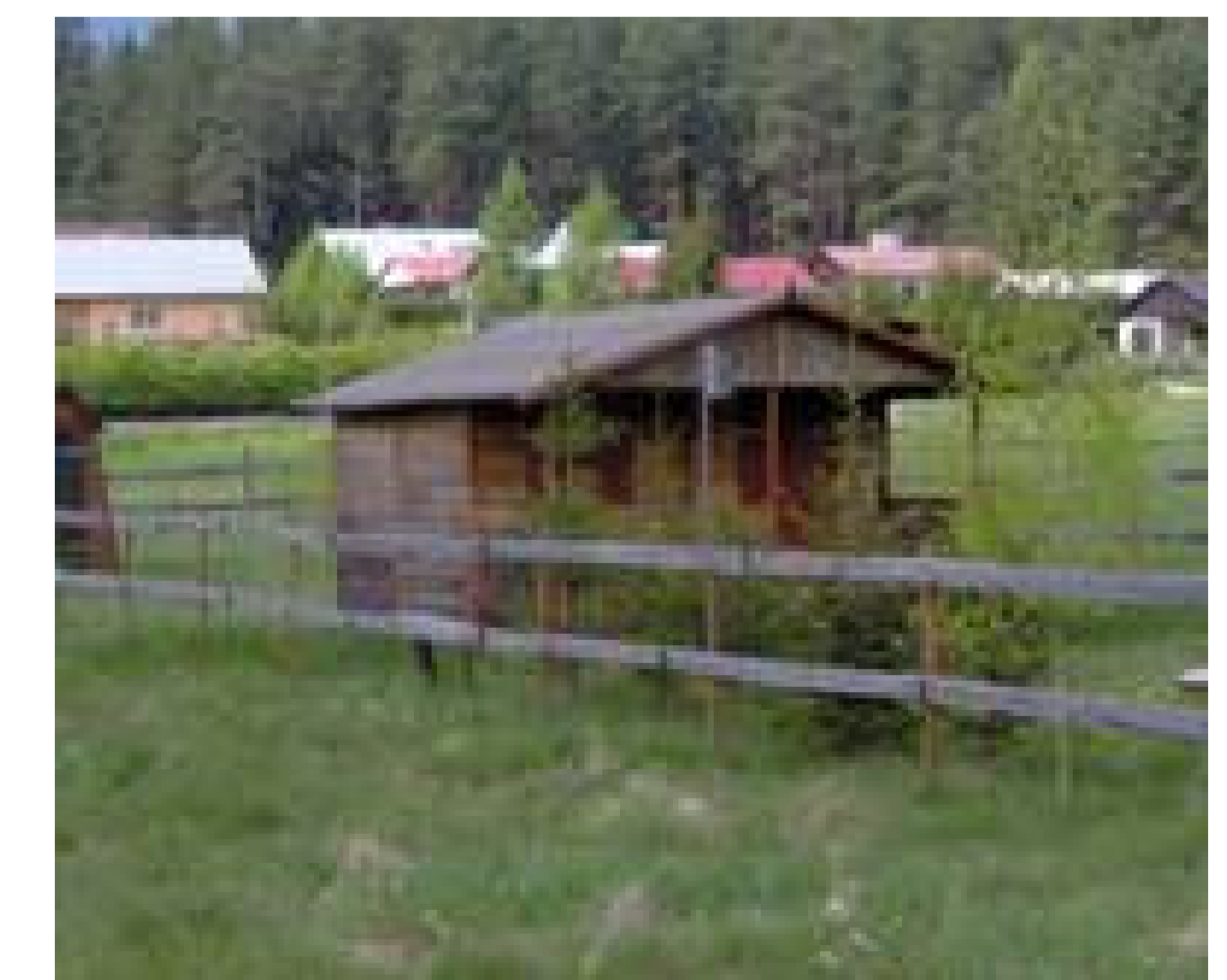
Recreational areas near Dadaj Lake