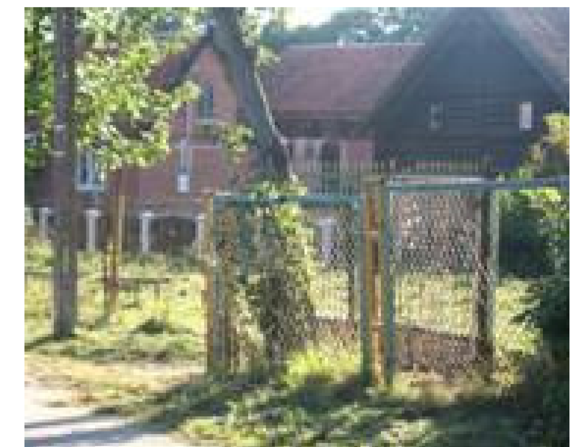
The agritourism farm