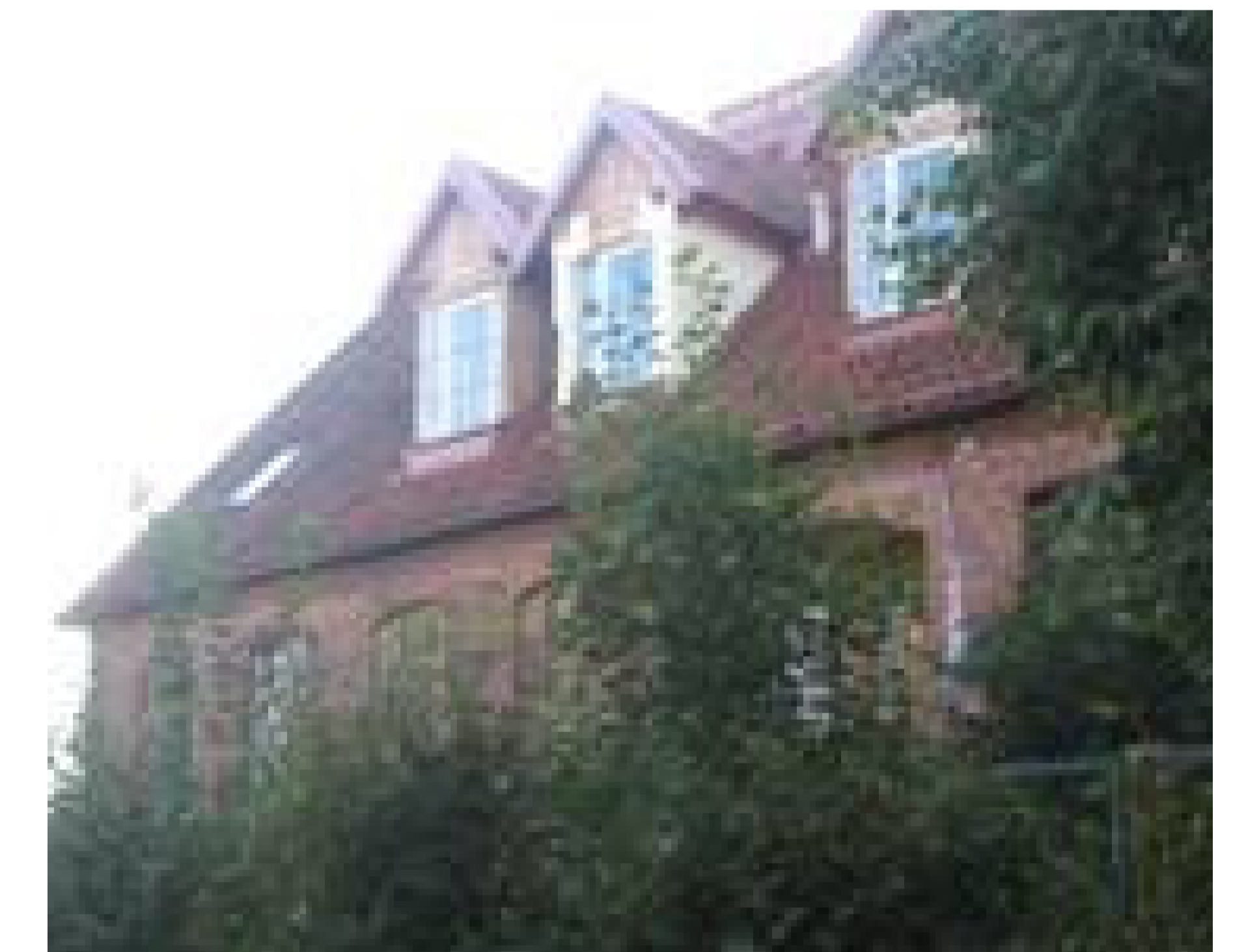
To find the function for old school