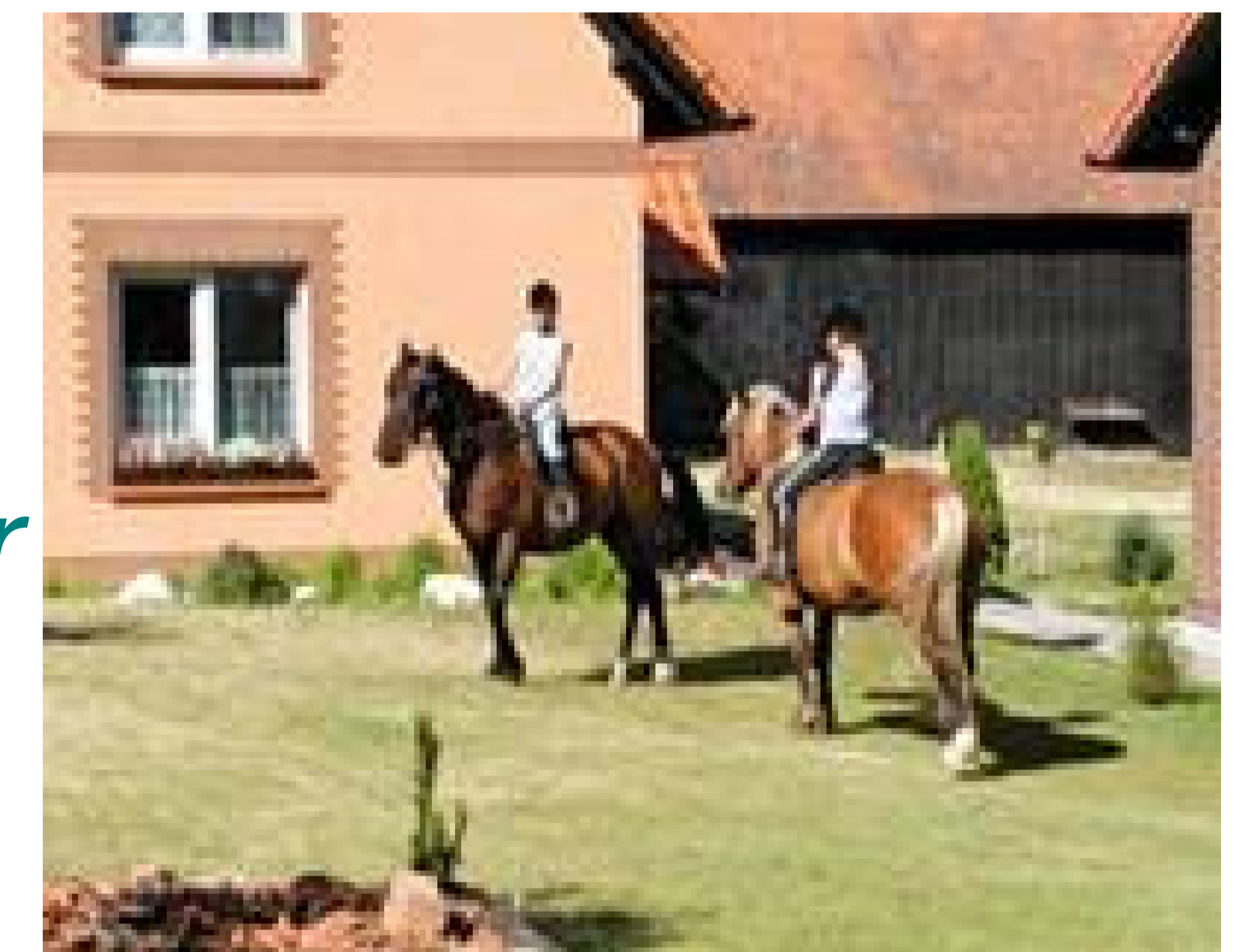
Agritourism farm in Wilimy II