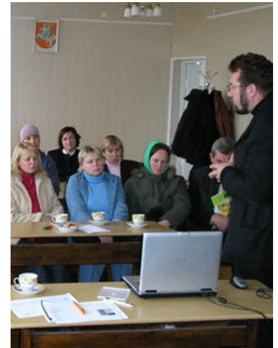
Pilot meeting in Viešvilė